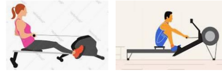
The BISB Rowing Crew

Money raised goes to the European Parkinson's Disease Association