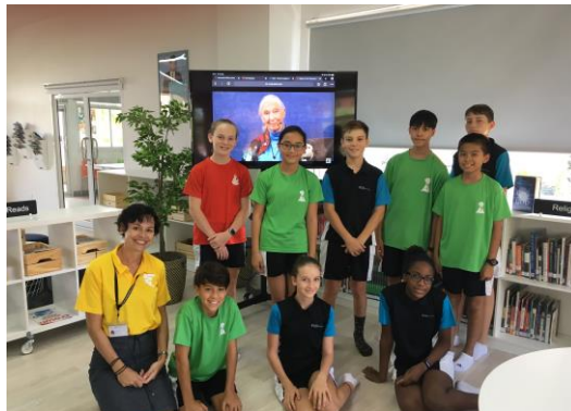
Skype sessions with inspiring role models, such as Dr. Jane Goodall