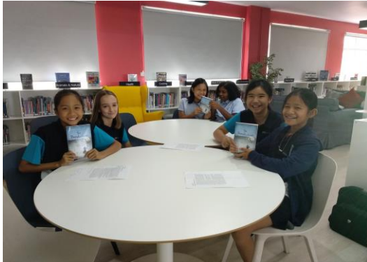
Collaboration with other schools using Skype