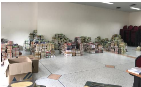
Only to be unpacked again and weeded a few months later