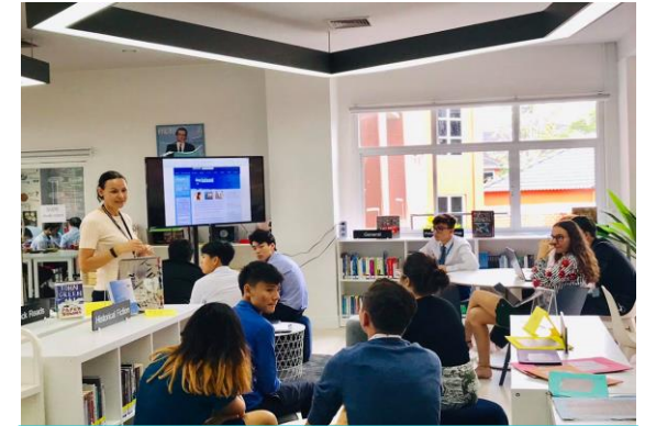
Literacy Skills lessons