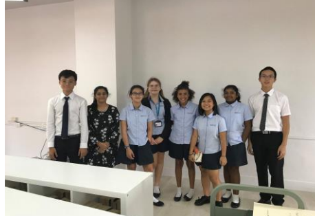
Students came in and helped us getting ready!