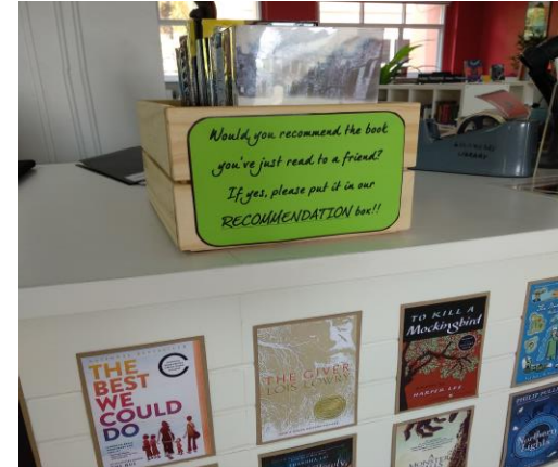
Encouraging students to read (Fiction, Non-Fiction, Magazines, etc.)