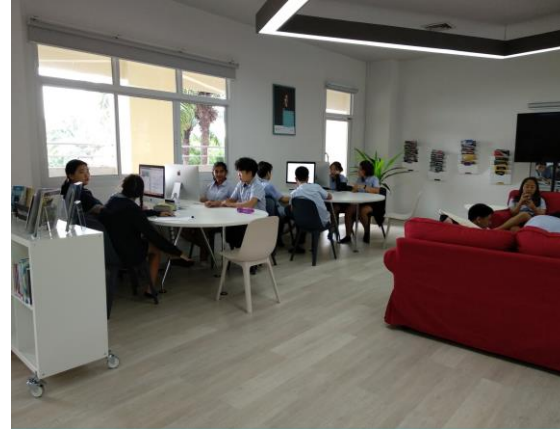
Use of technology: iMacs, iPads, and Apple TV