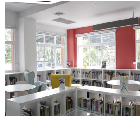
And it was completed in October 2019