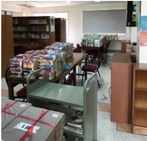
All books were packed up