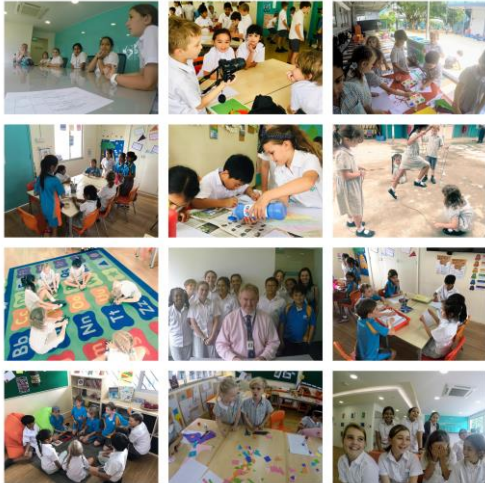
Dover Court Students took part in a range of activities this year.