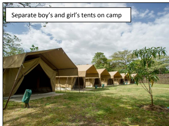
Separate boy's and girl's tents on camp