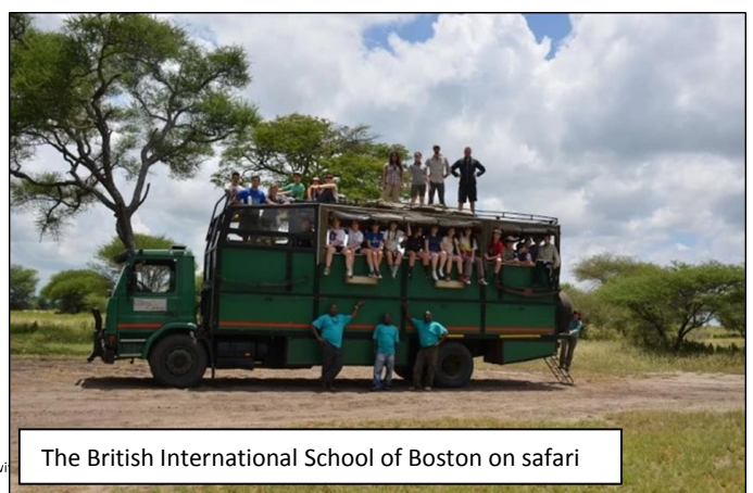
The British International School of Boston on safari