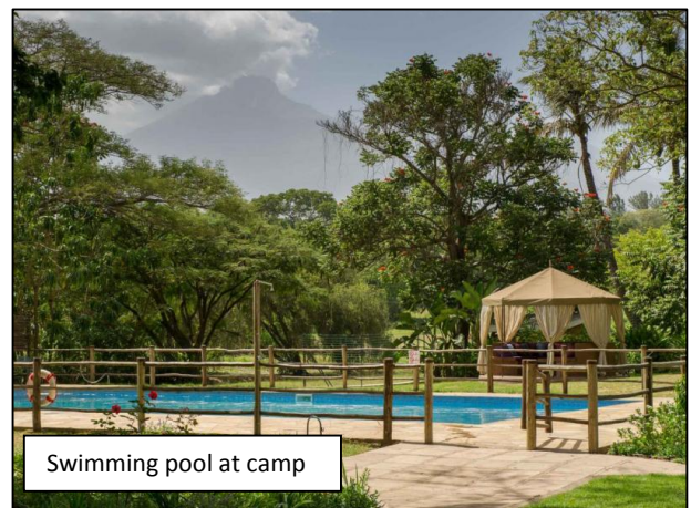
Swimming pool at camp