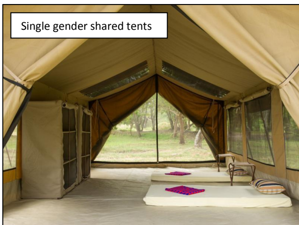
Single gender shared tents