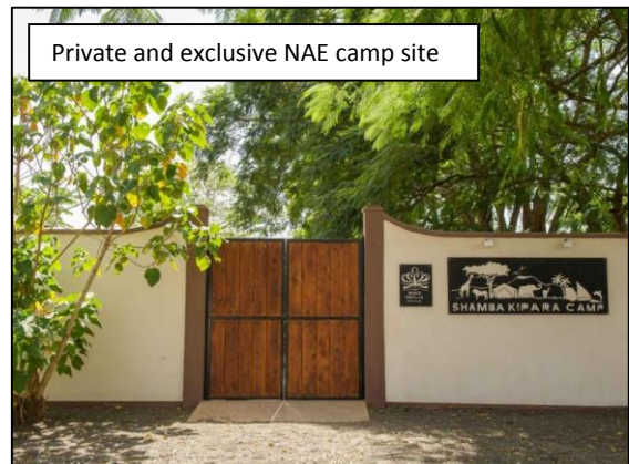
Private and exclusive NAE camp site