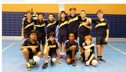
CIS Basketball Team

Some great basketball, a good win for Compass.