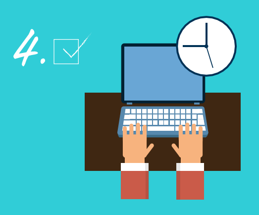
Complete any tasks set within the assigned period time