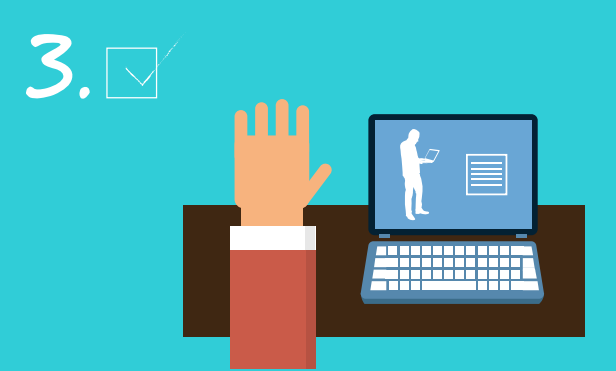
Attend lessons as specified by their teachers – the platform is designed to encourage real-time conversation and activity