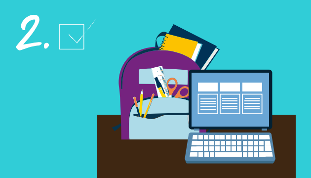
Check their dashboard for any assignments – they can submit all their assignments here too