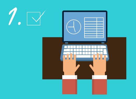
Sign in first thing in the morning