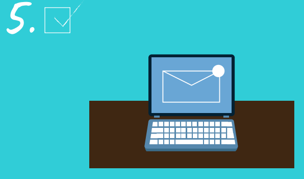
Check their emails regularly