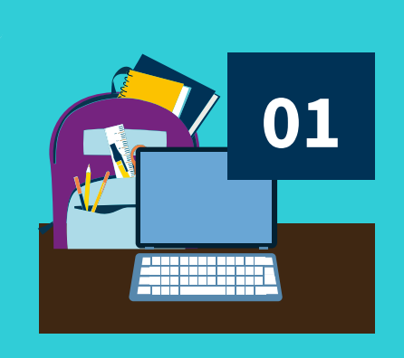
Check their expectations for the week which the school will update