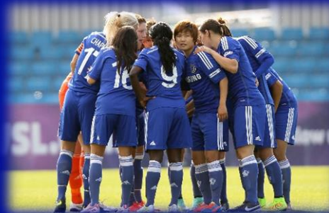
Ladies 1 st Team