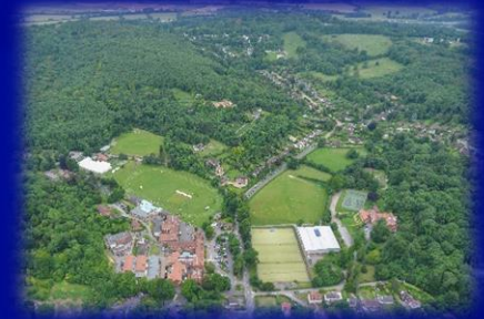
2 Full Size Pitches