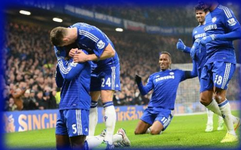
1 st Team