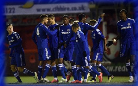
U18's Academy Team