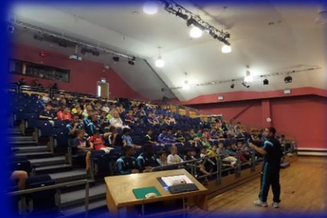
Auditorium & Leisure Time