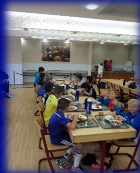
Food & Beverage Provision