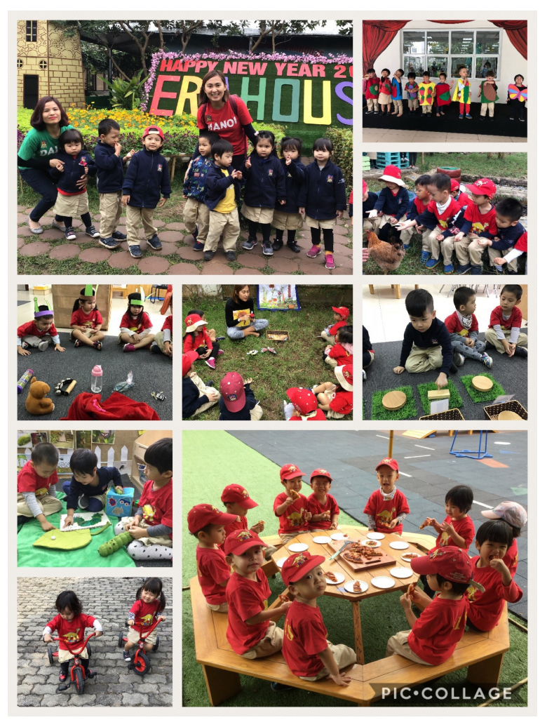
Term Three May 2018