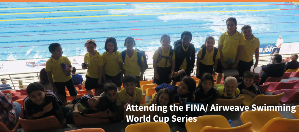
Attending the FINA/ Airweave Swimming World Cup Series