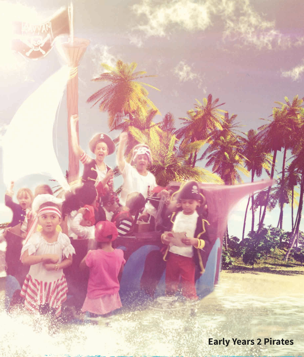
Early Years 2 Pirates