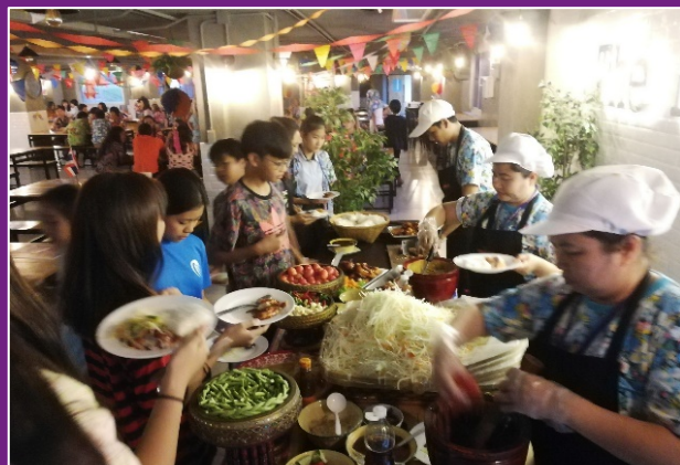
Celebrating Songkran in The Basement