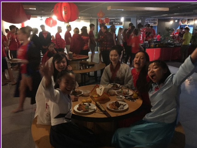
Celebrating Chinese New Year in The Basement

The House kitchens contain basic cooking facilities – hot water, refrigerator, toaster and microwave. Students should clear up after themselves, placing all rubbish in the bins, and washing up their own dishes. We advise that personal food items are kept in a lockable box.