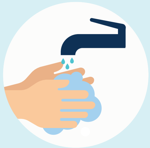
Wash my hands