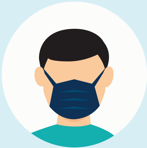
Wear my mask