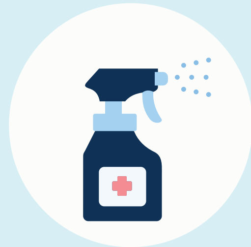
Clean my space