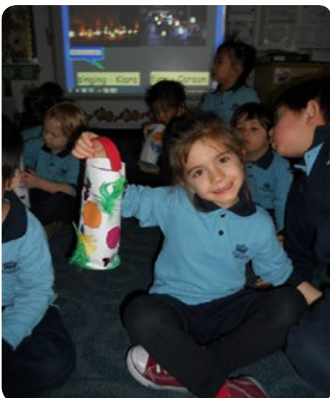
Home Made Lantern