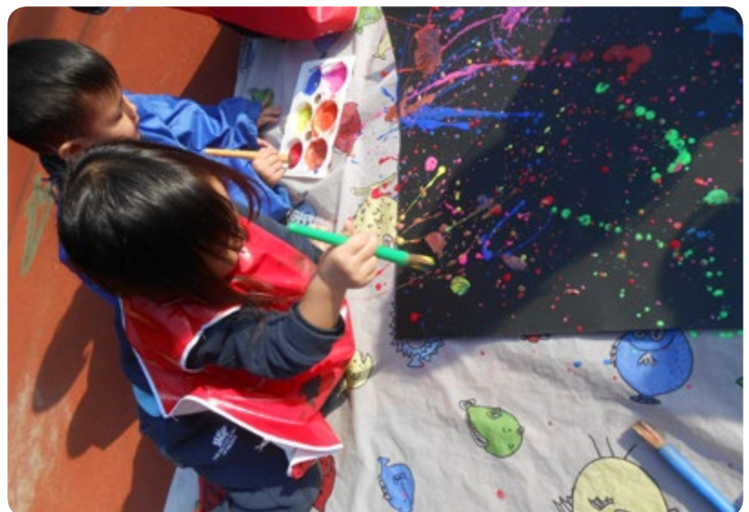
Splatter Paintings for Guy Fawkes