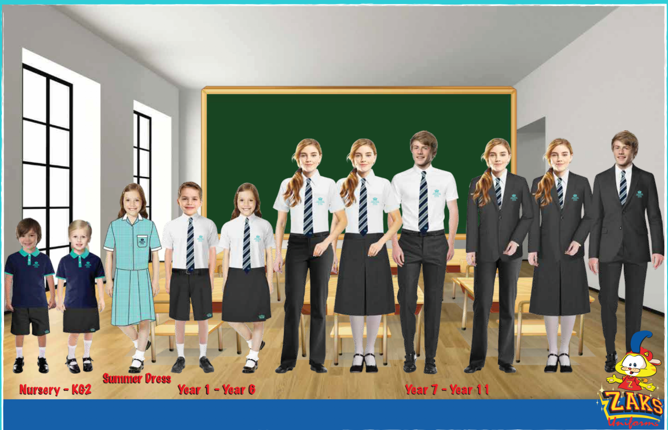
Nursery - K&2