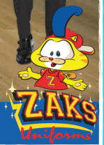
Year 7 - Year 11