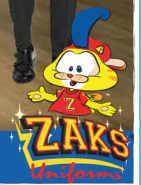
Year 7 - Year 11