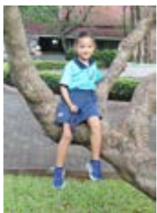
Amata (Year 2 Orangutan class)

The new representatives were elected by their peers after careful consideration of their applications. Congratulations to: