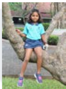
Saahraa (Year 2 Orangutan class)