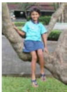
Parokshi (Year 2 Orangutan class)