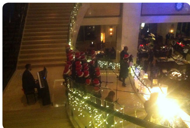
Our final performance at The Four Seasons