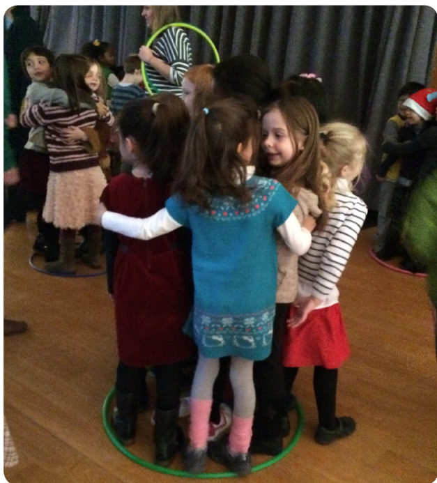
KS1 in Christmas Party

All classes in KS1 joined together for a fantastic disco on Thursday as part of their Christmas parties. They enjoyed dancing with their friends and teachers as well as playing some traditional British party games. I would like to wish all KS1 children and their families a very Merry Christmas and I look forward to seeing you again after the holiday.