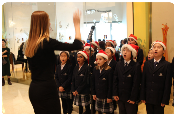
Performing at the Sunday Brunch at The Westin Financial Street