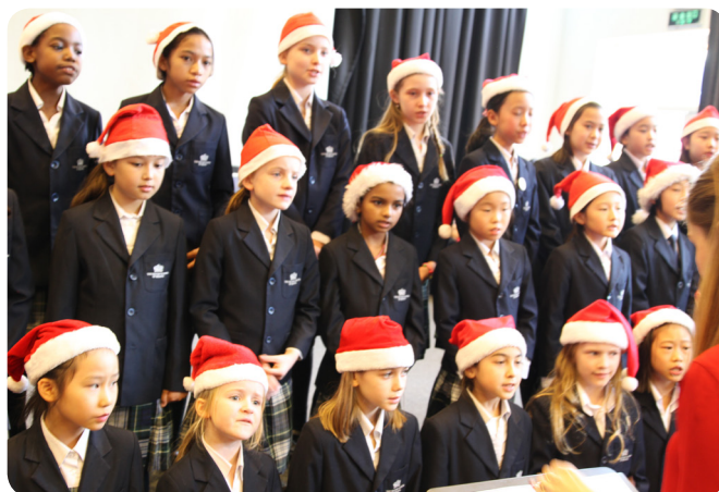
Our performance at our very own Christmas Cracker

We then returned to The Kerry Hotel, Adventure Zone, where we performed as part of the one year anniversary of the Adventure Zone's opening. We had in fact, performed there the year before for the actual opening, so it was great to be invited back for the anniversary celebrations. Our students also enjoyed the opportunity to play at the Adventure Zone after their performance. This was indeed a busy weekend and the following day we took the journey down to The Westin, Financial Street where we performed two sets at the Pre-Christmas Sunday Brunch. The students performed their first set on the staircase, as guests were welcomed to the hotel and into brunch, and the second performance took place within the actual brunch setting, where guests were able to gather around and join in with the Christmas songs. Over 90 of our BSB families also attended this event, so the choir had fantastic support from some very familiar faces in the audience.