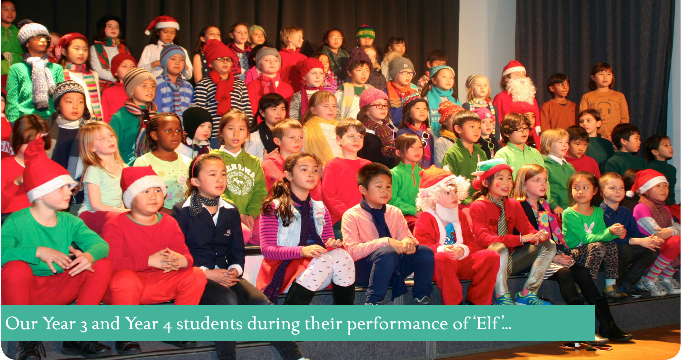
Our Year 3 and Year 4 students during their performance of 'Elf'...