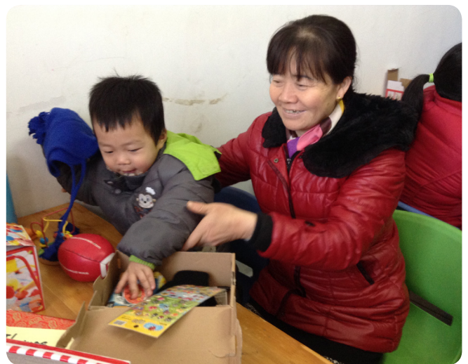
Year 6 delivering the shoeboxes that our BSB families generously donated