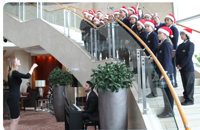
Welcoming guests at The Westin Financial Street