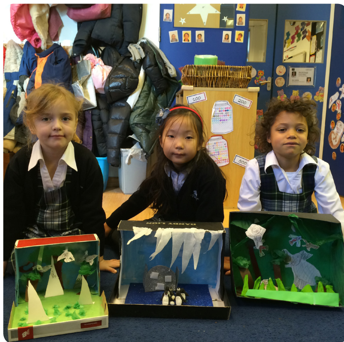
Year 2 showing the dioramas they created