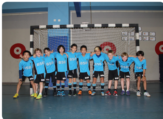
BSB U11 Handball Team