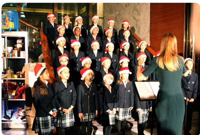
Our first performance at The Kerry Hotel

I would not be able to finish this term without giving a special mention to our Sanlitun Christmas Choir. This amazing group of 34 students have performed on five occasions during the last four weeks, giving up their weekends and evenings to represent our school. Our first performance took place at The Kerry Hotel, Christmas Tree Lighting, where the children sang two sets of Christmas songs, whilst guests enjoyed drinks and nibbles in the hotel foyer. Our second performance took place at our very own Christmas Cracker event, where the children sang on our school stage whilst a range of arts and craft activities took place in our school hall.