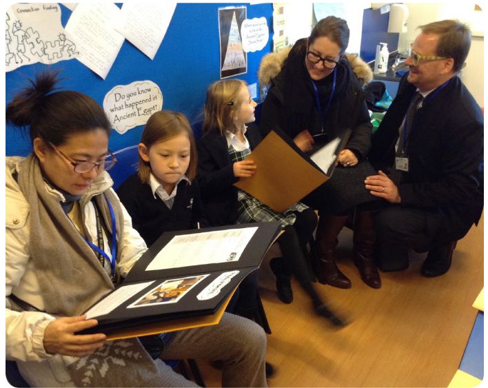
Year 3 sharing Ancient Egyptian topic with their parents

As our first term comes to a close, I would like to thank all members of the Key Stage 2 team for their continual energy and hard work. I would also like to thank you as parents for supporting us by helping the children to recognise that learning takes place beyond the classroom.