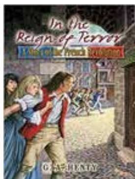
In the Reign of Terror: A Story of the French Revolution by G. A. Henty

Although the examination will only assess a small selection of specified points, students who engage in wider reading about the topic always have a much firmer grasp of the period being studied than those who don't. The two books below are very broad and engaging reads on topics that will be assessed, and they go beyond the curriculum in ways that will help students develop a better picture of the world during the Age of Revolution.