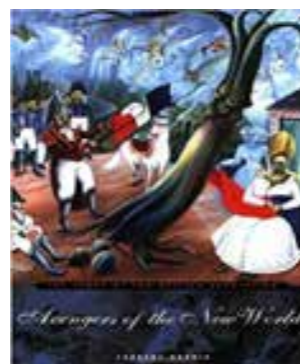
Avengers of the New World: The story of the Haitian Revolution by Laurent Dubois

ISBN-10: 0486466043 ISBN-13: 978-1407165684