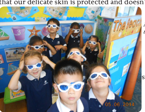
Nursery children planning for their visit to the beach

We have also been thinking about sun safety and talking about all the things we do to protect ourselves when we go in the sun. Even though we enjoy the weather being warmer and the sun shining, we know that the sun is very strong and that we need to be careful so that our delicate skin is protected and doesn't burn.