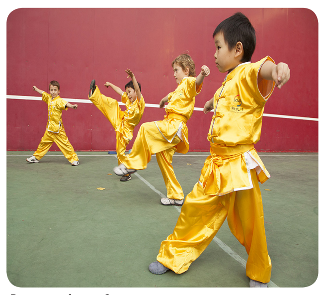
Practice makes perfect

'I know you will be able to do this.' Give encouragement to promote a desire and belief that they can do it. Your praise and encouragement is invaluable.