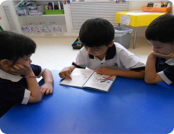
Reception children sitting and listening beautifully whilst the Year 2 children share their favourite books