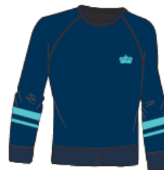
Tracksuit top/ Zippered tracksuit