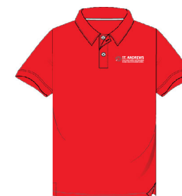
POLO HOUSE SHIRT ( RED AKHA )