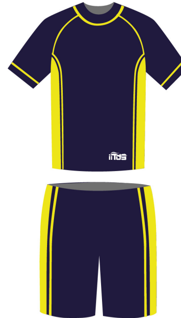
BOY'S SWIM TOP & SHORTS

Students are to wear their Swimming Kit according to the time slot in their schedule.