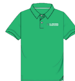
POLO HOUSE SHIRT ( GREEN KAREN )

Students are assigned a house colour and the house polo is worn every Friday.