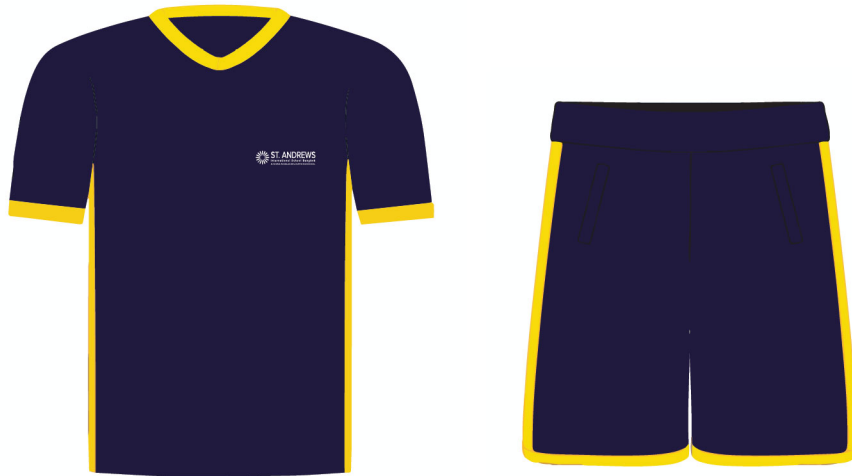
UNISEX PE TOP & SHORTS

Based on their schedule, students are to wear the PE Kit from home or change into them according to the time slot in their schedule.