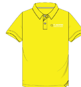
POLO HOUSE SHIRT ( YELLOW LAHU )