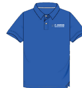
POLO HOUSE SHIRT ( BLUE YAO )