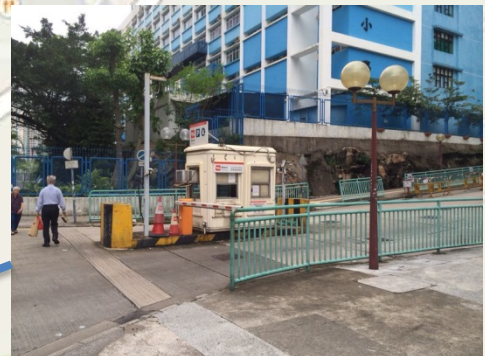
Hing Tin Street Car Park (2 minutes walk)