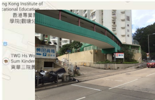
Hing Tin Estate Car Park, Lin Tak Road (5 minutes walk)