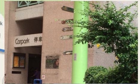
Pik Wan Road Car Park (1 minute walk)