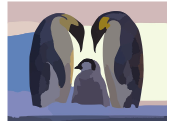
Parents & Family

The community celebrates with students at the PYP Exhibition celebration.