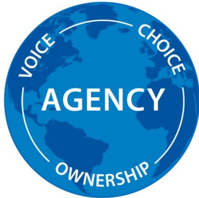
Figure LA01: Agency

PYP coordinator: bissy.groom@nisc.edu.kh