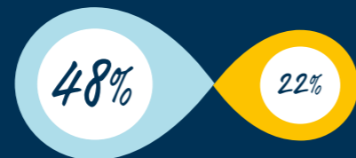
The British School of Guangzhou (BSG) UK Average

% of exams taken achieving A or A* grades