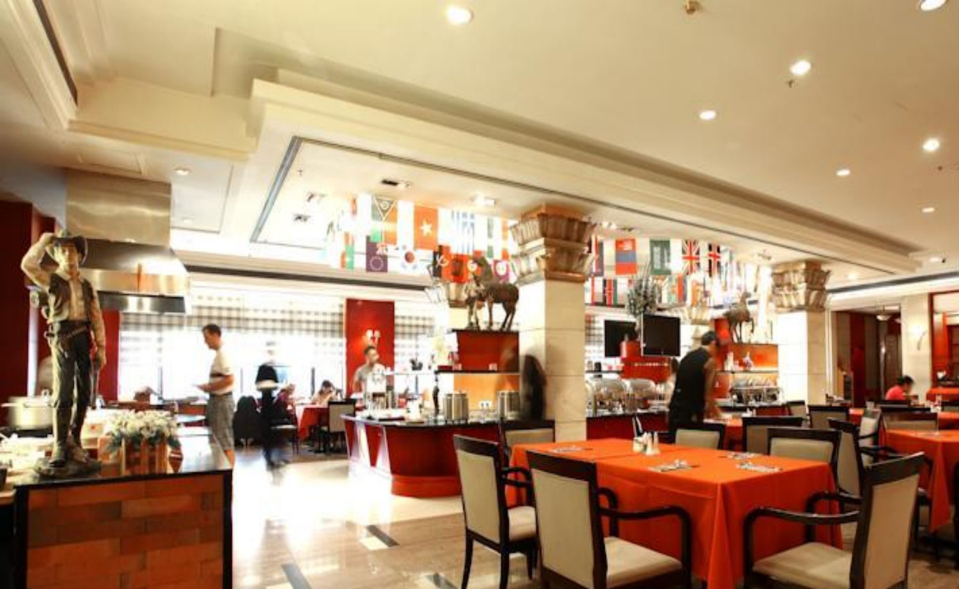
Bell Tower Hotel Xi'an