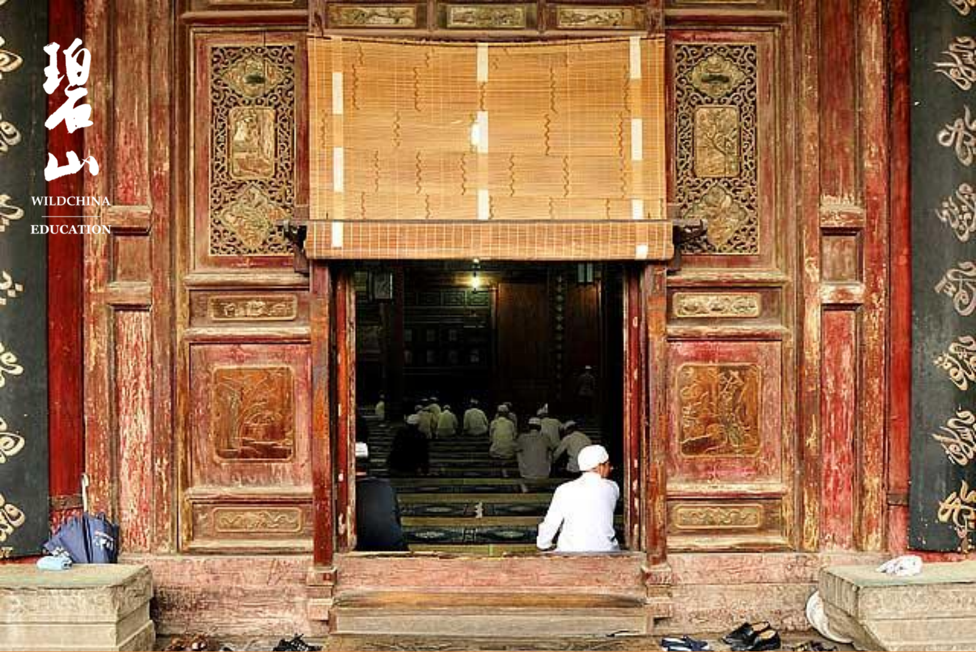
Day 5: Great Mosque + return to Beijing