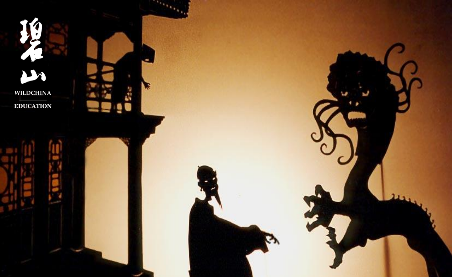
Day 1: Muslim Quarter + Shadow Puppet Show