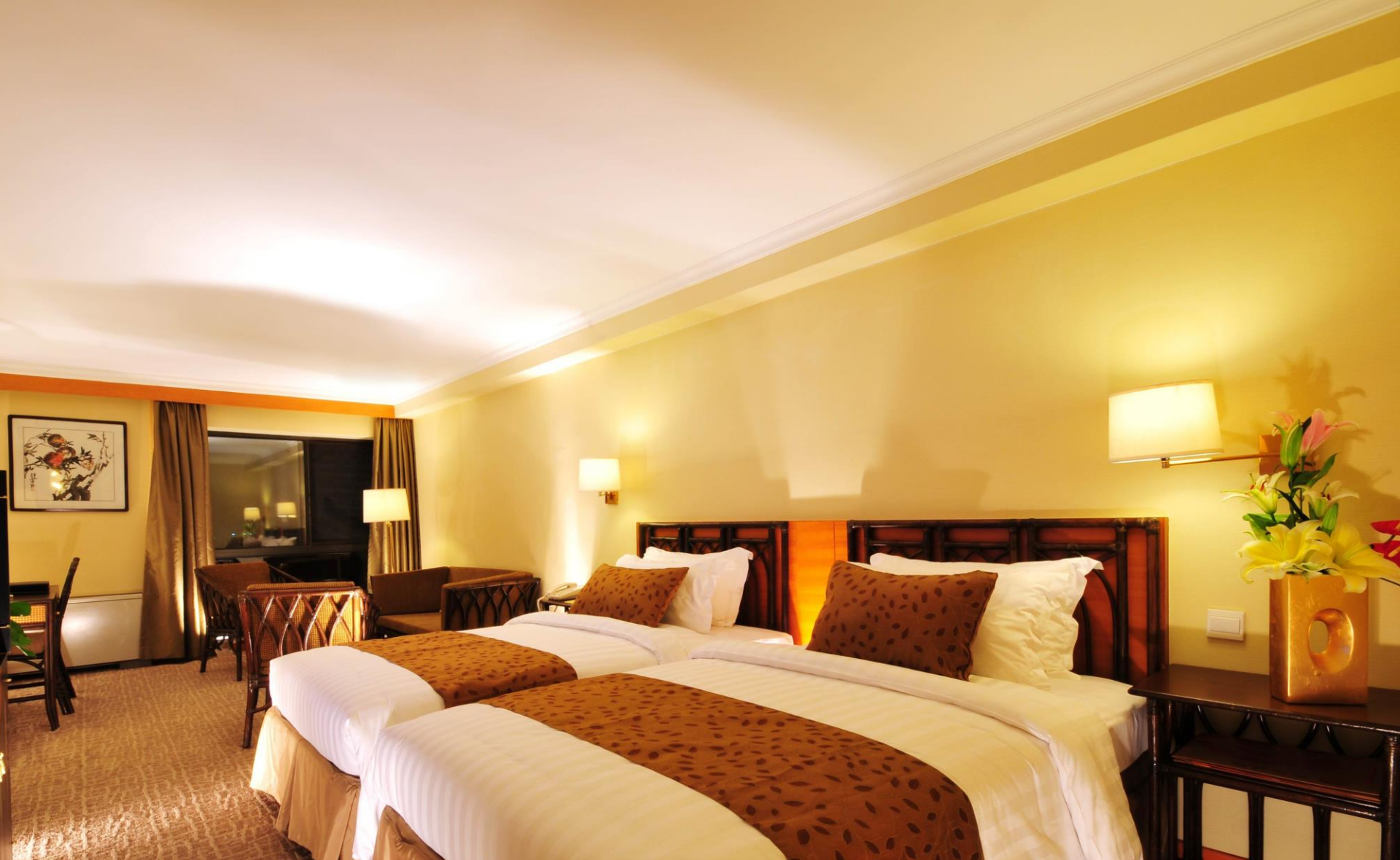
Bell Tower Hotel Xi'an