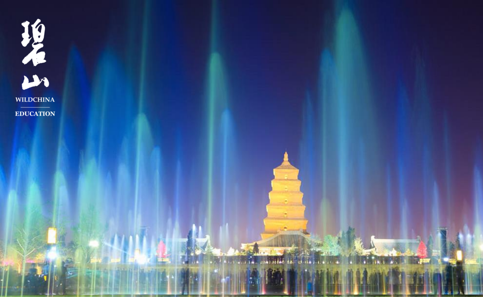
Day 2: Ancient City Wall + Shaanxi History Museum + Big Goose Pagoda