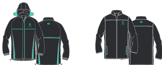
34. 2-in-1 Outdoor Jacket