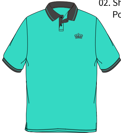
02. Short-Sleeve Polo Shirt