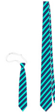
16. Primary School Tie