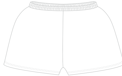
44. Under Shorts