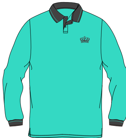
40. Long-Sleeve Polo Shirt