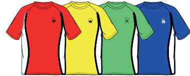
22. House T-Shirt