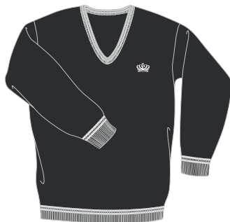
06. Wool Jumper