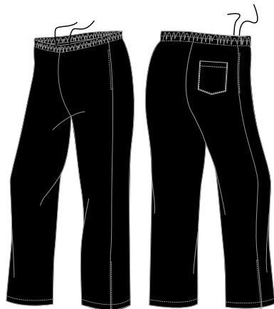
42. Track Pants