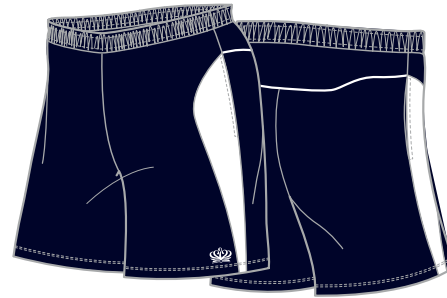
23. PE Shorts