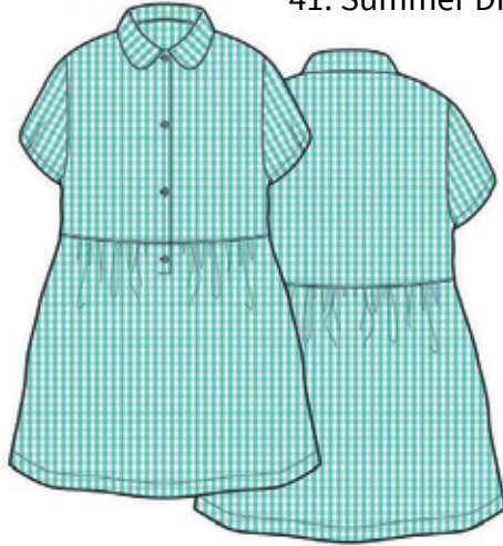
41. Summer Dress