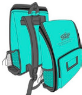
01. School Bag (Toddler - Year 4)