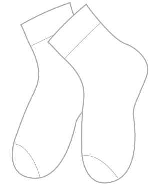
00. Ankle Socks