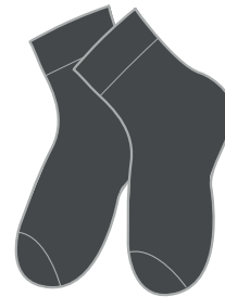
05. Ankle Socks