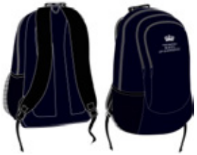
09. School Bag (Y5+)