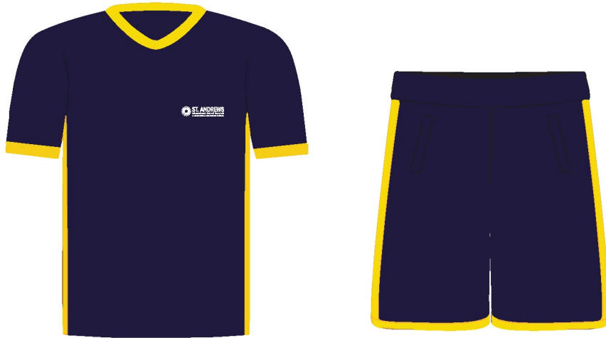
UNISEX PE TOP & SHORTS

Based on their schedule, students are to wear the PE Kit from home or change into them according to the time slot in their schedule.