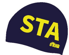
Silicone Swim Caps