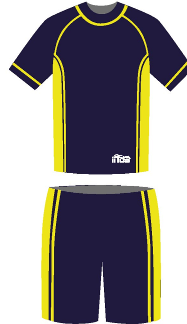
BOY'S SWIM TOP & SHORTS

Students are to wear their Swimming Kit according to the time slot in their schedule.