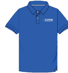
POLO HOUSE SHIRT ( BLUE YAO )