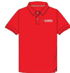
POLO HOUSE SHIRT ( RED AKHA )