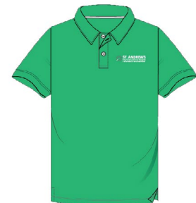
POLO HOUSE SHIRT ( GREEN KAREN )

Students are assigned a house colour and the house polo is worn every Friday.