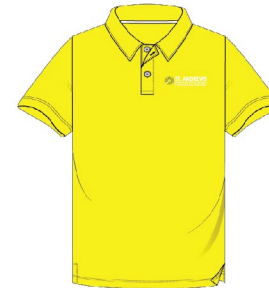
POLO HOUSE SHIRT ( YELLOW LAHU )