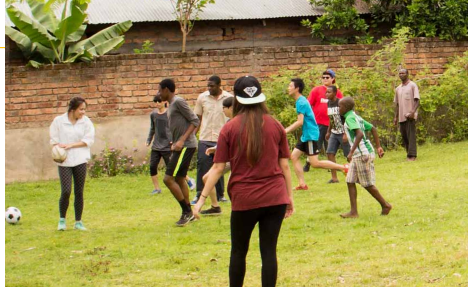
Students from The British School of Beijing, Shunyi, at the Seeway Tanzania Children's Centre