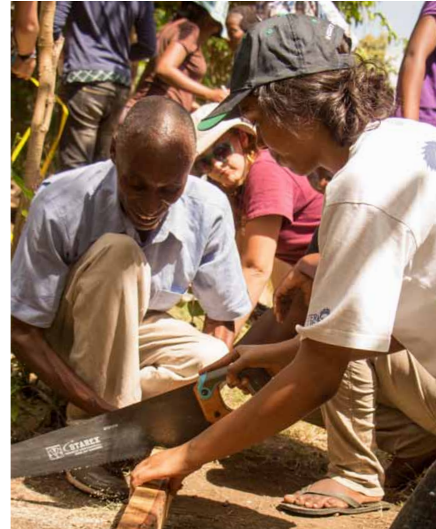
Students from The British School of Beijing, Shunyi, working on a community goat shed project

Due to the nature of working in Tanzania and supplies not always being available it is not possible for us at this stage to specify the project that each group will work on. Your child will be spending two full days working with Kitefu primary school and a further day and a half working in the local community on at least one of these exciting projects. We will endeavour to let you and your child know what projects they will be working on closer to their departure. The opportunity for your child to take part in the NAE Tanzania service programme is only open to students from the Nord Anglia Education family. It is a truly rewarding chance to make a significant impact on improving the lives of others while strengthening their own personal leadership, flexible thinking and collaboration and teamwork skills.