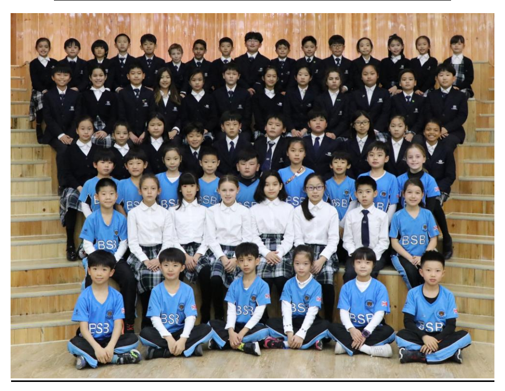
<u>Aqua Bears Secondary Swim Team BSBSY 2020 – 2021</u>