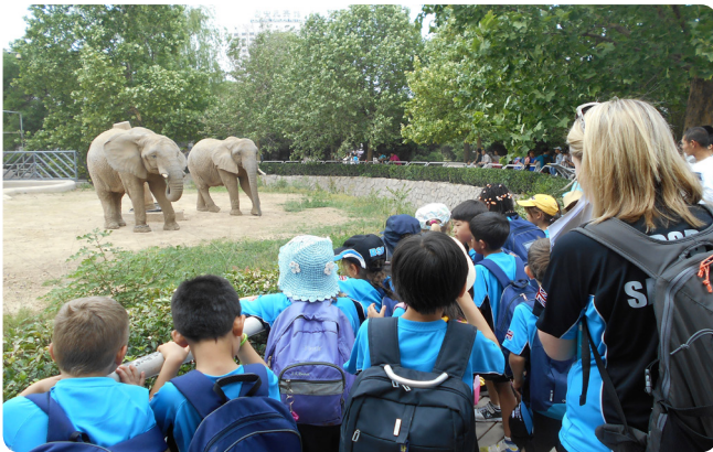
Year 1 visit Beijing Zoo

Our new topic 'This is Africa' has started with a fantastic trip to Beijing Zoo! We got to see some amazing African animals including Zebra's, Giraffes, Elephants and Lions! The children looked closely at their markings and patterns, sketching what they could see. We also discovered two different types of elephant – African and Indian, the children looked at both really closely to spot any differences between the two, noticing their size as well as the shape of their ears.