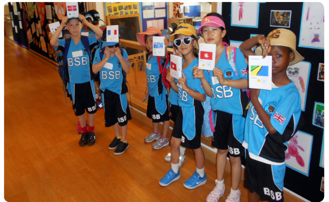
Passports ready and off to Africa!