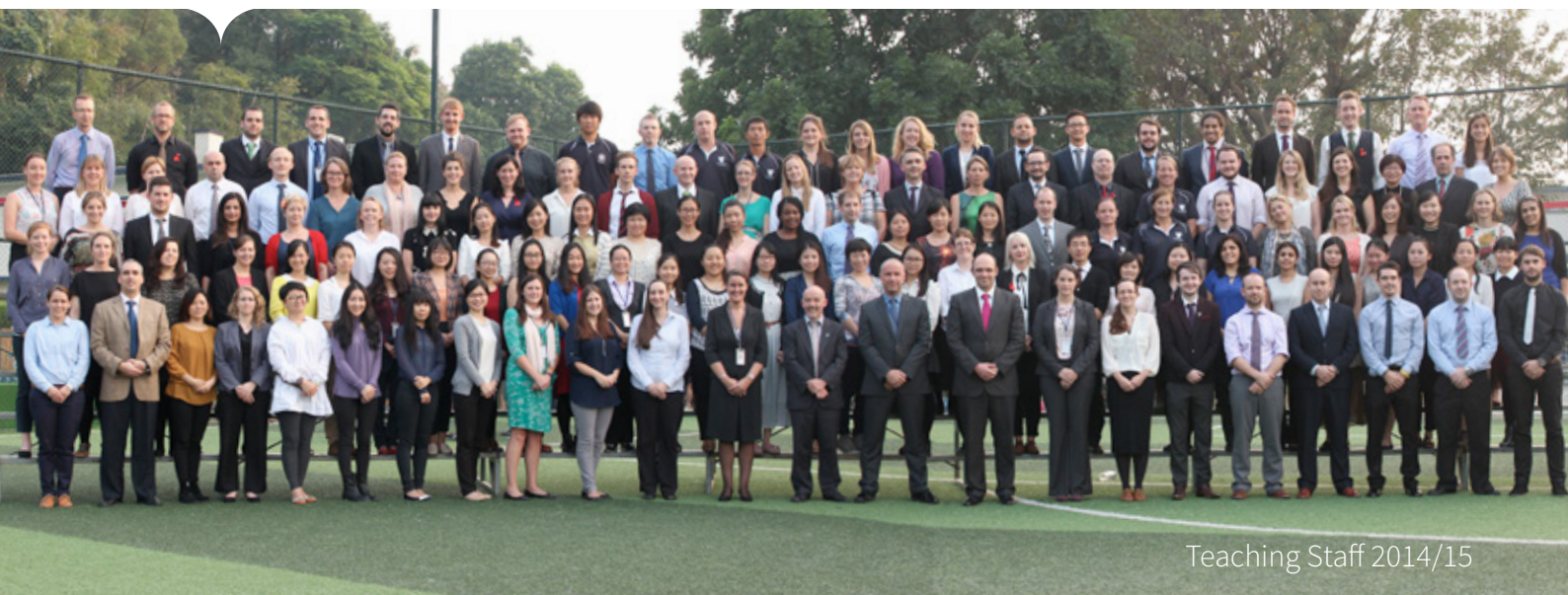
Teaching Staff 2014/15

Almost every employee of The British School of Guangzhou is currently involved in a two-year process of self-study and improvement that will be assessed by representatives from the Council of International Schools.