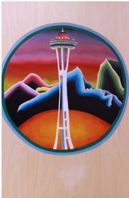
Alexander Cox - Y11 - Acrylic on wood

As the first term drew to a close, so did the coursework projects for our A Level and GCSE students. With themes inspired by 'Freedom and Limitations', 'Surfaces' and 'Cityscapes', our artists worked exceptionally hard to develop projects with research taken directly from the world around them. Using their own imagery, they explored and experimented with a range of ideas and media, allowing them to come up with a final design. During a 10 hour mock exam, they drew, painted, dripped, scraped, sculpted, glued and layered their work together to create a truly inspiring collection.