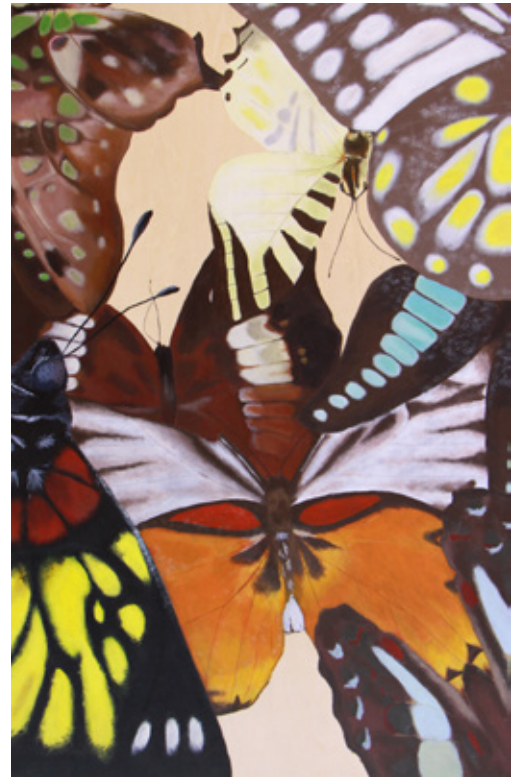
Min Sung Kim - Y12 - Acrylic on Wood