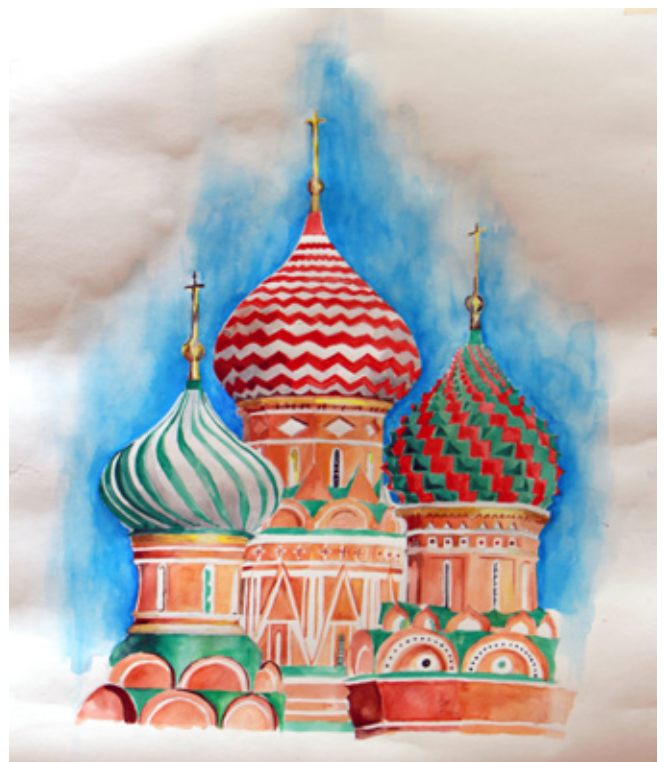
Victoria Lu - Y11 - Watercolour