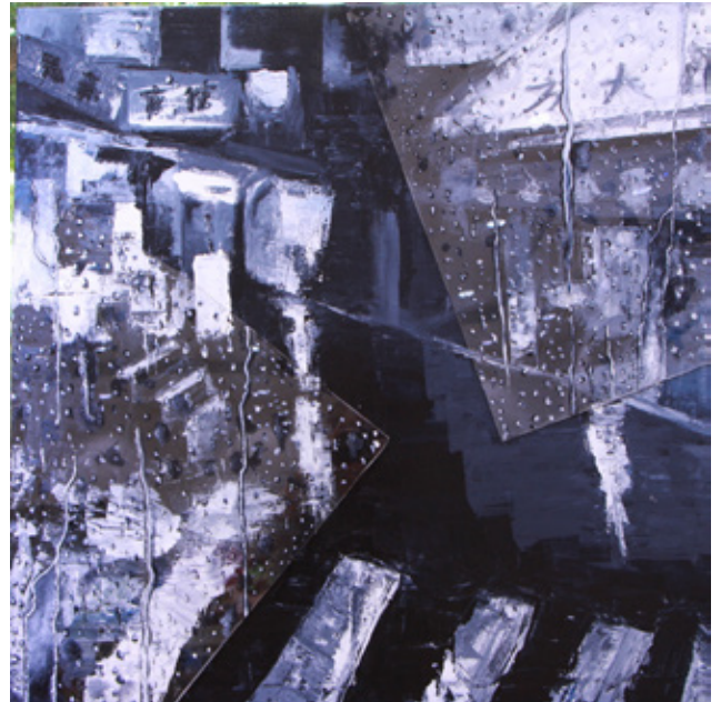
Nicole Wong - Y11 - Mixed media on canvas