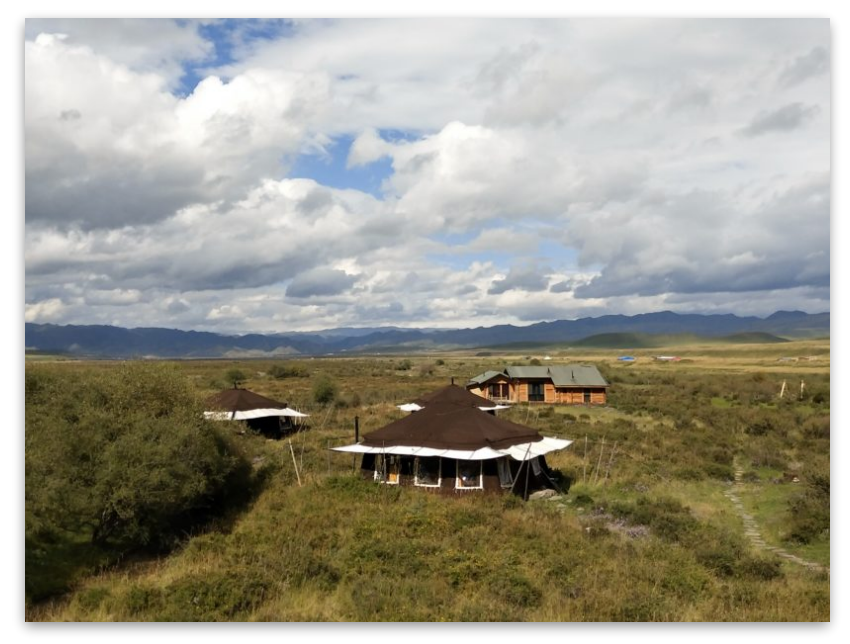
Norden Camp near Labrang is an example of a Tibetan owned business promoted on Tibetpedia

"Travel with us and support Tibetpedia! This site represents the core of our CSR value. Tibetan Business Highlights is the feature of this site that promotes Tibetan small businesses of excellence across the plateau." - Jim Hamp, Co-founder - Extravagant Yak