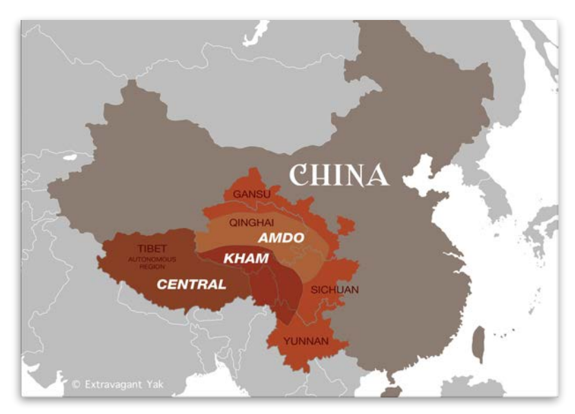
Chengdu, Sichuan, is the gateway city to all three Tibetan areas in SW China: Central. Kham & Amdo

We love what we do. Extravagant Yak exists to provide second-to-none overland travel services to some of the most geographically extreme and culturally fascinating corners of Tibet. Our 15 years experience in this region uniquely qualifies us to have hands on control of the quality of your trip. Regardless of the trip type, each trip is designed for the expectations of international travellers.