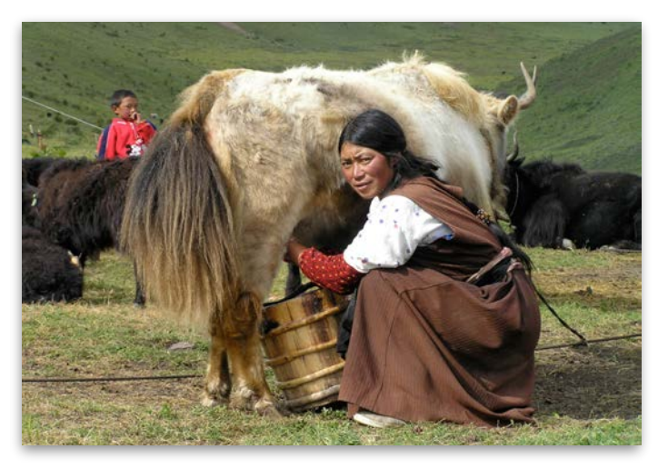
Yak milk is essential to nomad families