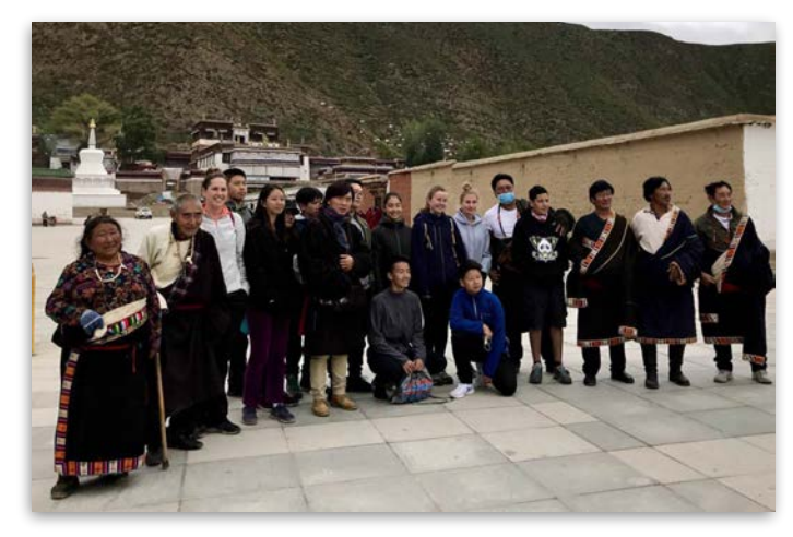
Introduction to Tibetan culture and people