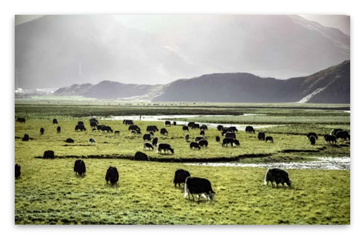
Nomad pastures near Sangkok Gigu Valley