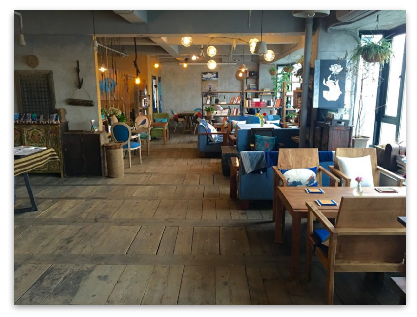
Charu Co-Working Space in Chengdu is an example of a Tibetan owned business promoted on Tibetpedia