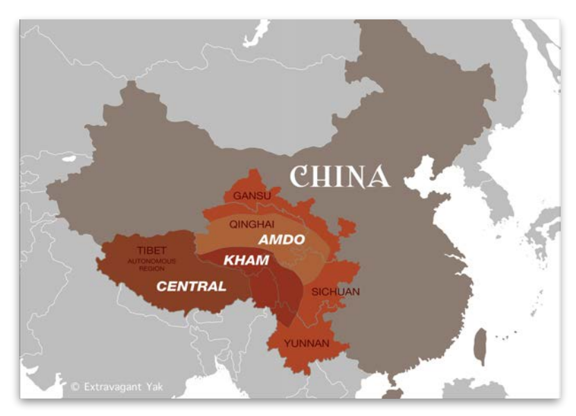
Chengdu, Sichuan, is the gateway city to all three Tibetan areas in SW China: Central. Kham & Amdo

We love what we do. Extravagant Yak exists to provide second-to-none overland travel services to some of the most geographically extreme and culturally fascinating corners of Tibet. Our 15 years experience in this region uniquely qualifies us to have hands on control of the quality of your trip. Regardless of the trip type, each trip is designed for the expectations of international travellers.