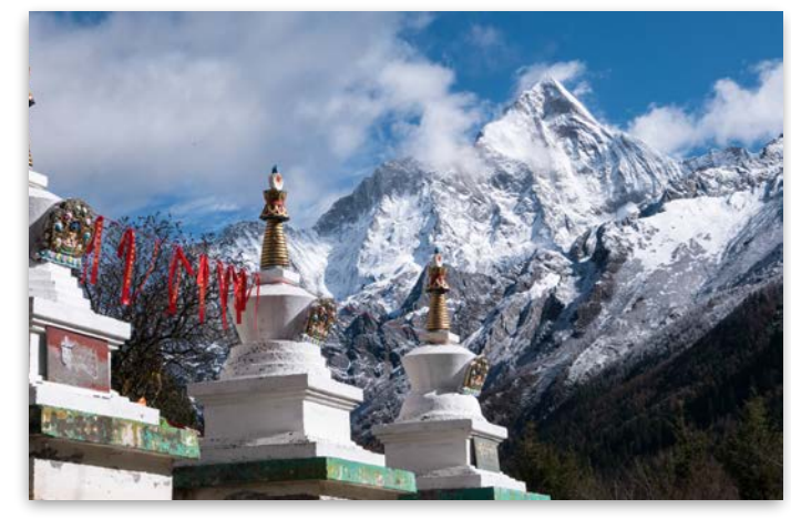
Majestic Snow Mountains of Siguniangshan