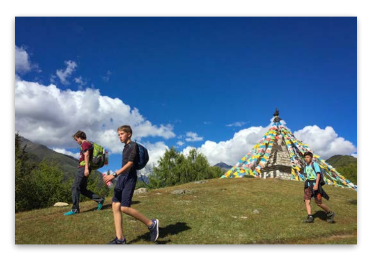
Trekking through an alpine wonderland