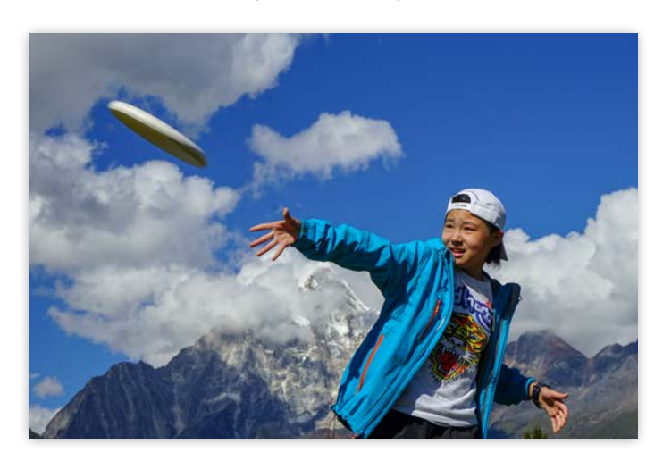
Lots of opportunity for activities