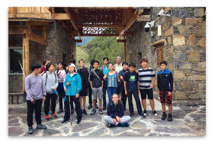
Exploring the area