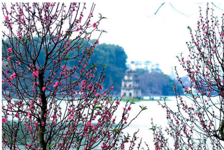
Hang Luoc Street on days close to Tết.