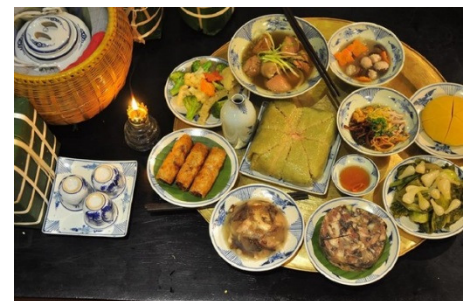
A typical meal offering to ancestors.

Vietnamese families traditionally lay out a tray of 5 fruits at the altar called "Mâm Ngũ Quả". The fruits are colorful and meaningful.