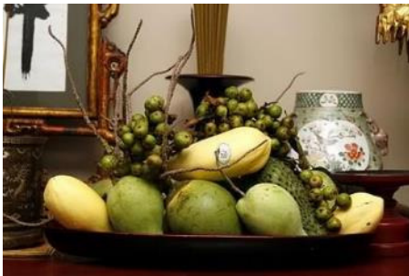
Fruit offering in the South include custard apples, coconuts, papayas, mango and goolar fig. In Vietnamese they are "Cầu, Dừa, Đủ, Xoài, Sung" which in the South literally is a prayer to "have enough to use" in the New Year.