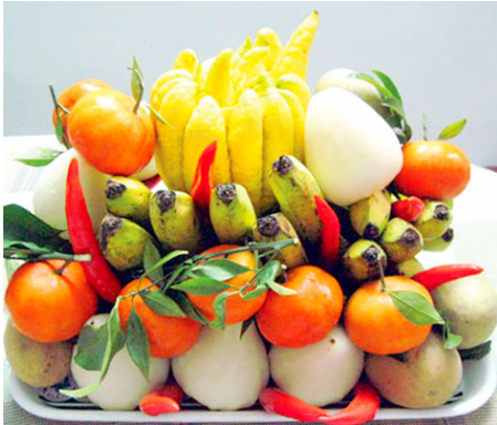
Fruit offering in the North include kumquats, bananas, oranges and Buddha hands.

Asian mythology, the world is made of five basic elements: metal, wood, water, fire and earth. The plate of fruits on the family altar at New Year is one of the several ways to represent this concept. It also represents the desire for good crops and prosperity.