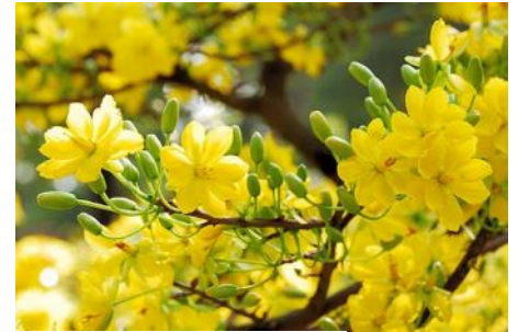
Hoa Mai ( Ochna Integerrima )

later in the year. These two distinct flowers are widely sold and purchased during Tết. The spectacular yellow flowers of the Hoa Mai ( Ochna integerrima ) make it very popular in southern Vietnam.