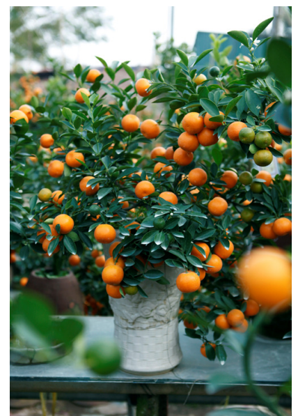
Cây Quất ( Kumquat Tree )

Like a "family tree", the Kumquat plant symbolically represents the many generations of a household. The fruits are grandparents, the flowers are parents and the buds and green leaves are children. Kumquat plants should be carefully selected for their symmetrical leaves, color and shape of fruit.