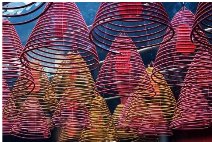
Burning incense in Chinese Temple District 5 (a piece of paper is attached to the incense, prayer writes name of the deceased or those who they are praying for).

Floating Flower Market: The Crescent Mall, Dist. 7, from 7pm, 21 Jan to 8pm 02 Feb. This year's theme is "Prosperous Spring" with traditional country Vietnamese food and flower market.