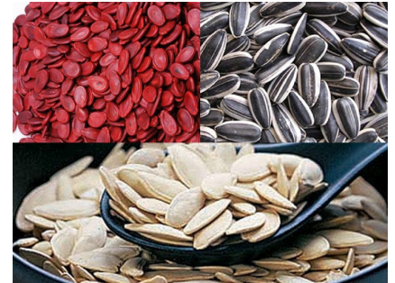
Hạt Dưa, Hạt Bì, Hạt Hướng Dương (roasted seeds).