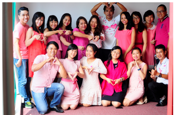
Santa Fe Vietnam supported for Breast Cancer Fund