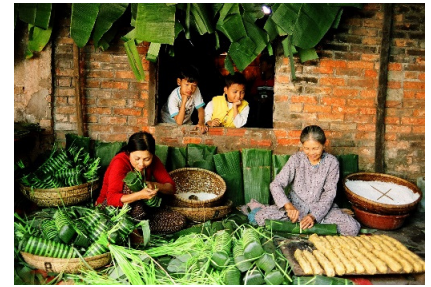
Preparing Bánh Chưng