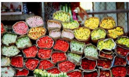
Ho Thi Ky Flower Market (open all year)

Similar to the pine tree for Christmas holiday in the West, Vietnamese also use many kinds of flowers and plants to decorate their