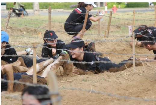
2016 Champion Dash Challenge