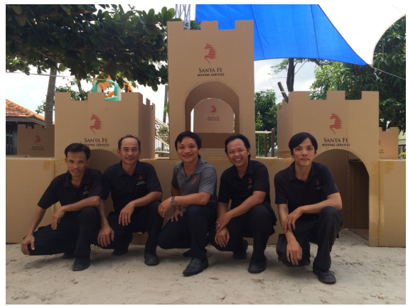
Supporting for AMCHAM event 4 th of Jul 2016