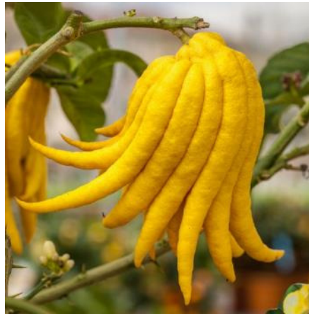
Quả Phật Thủ, (Buddah's Hand) fruit, considered good luck.