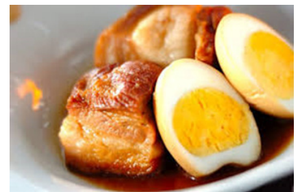
Thịt Kho Tàu (meat stewed in coconut juice)