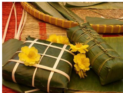
Bánh Chưng and Bánh Tét

Thịt Kho Tàu : "Meat Stewed in Coconut Juice", a traditional dish of pork belly and medium boiled eggs stewed overnight in a broth-like sauce, often eaten with pickled bean sprouts and chives and white rice.