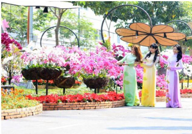
Flower Display on Nguyen Hue Street in Ho Chi Minh City

Tết Flower Markets: located in more than 113 places in Ho Chi Minh city, the biggest ones are at 23/9 Park (Pham Ngu Lao Street near Ben Thanh Market, Dist.1), Gia Dinh Park (corner of Nguyen Kiem Street and Nguyen Thai Son Street, Binh Thanh Dist.) and Le Van Tam Park (corner of Hai Ba Trung Street and Dien Bien Phu Street, Dist.3) from 20 – 27 Jan.