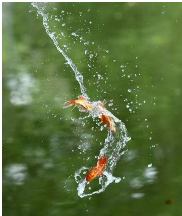
Each year, 7 days before Tết locals release small carp into fresh water. The carp serve as vehicle for Ông Táo or the Kitchen God to travel to the Jade Emperor.