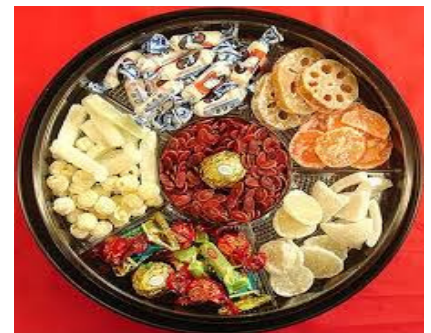
Mứt (dried fruit)