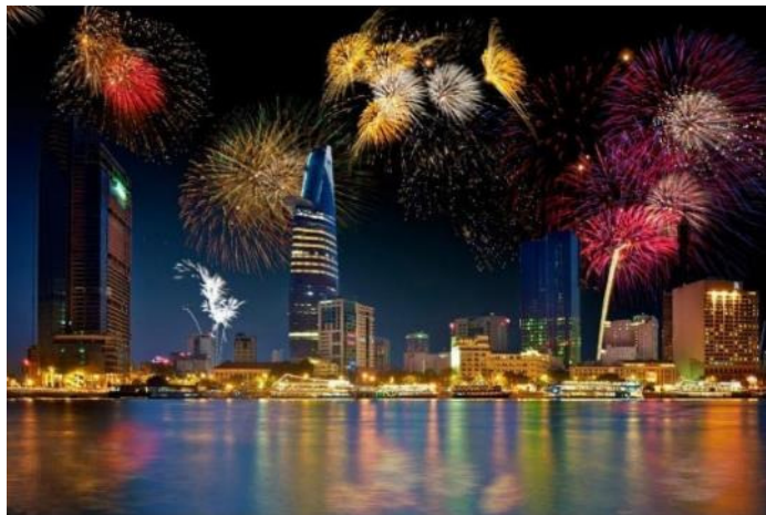
Fireworks on Saigon River 2016

Cinemas will remain open. Check their web pages for viewing times ( www.megastarmedia.net ) ( www.lottecinemavn.com ) ( www.galaxycine.vn ) ( www.cgv.vn/en ) ( http://bhdstar.vn/en )