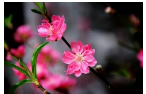
Hoa Đào ( Peach Blossom )

Hoa Đào (peach blossom) is more common in the North as it can grow in the dry and cold weather. It is used to ward off evil spirits during the Tết celebrations.