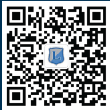
订阅号 Official Account