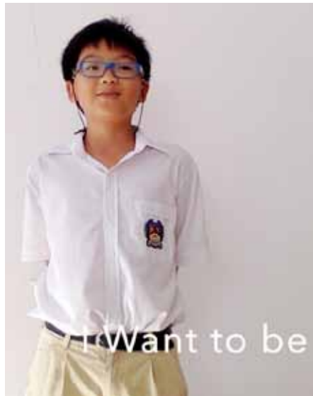
I want to be