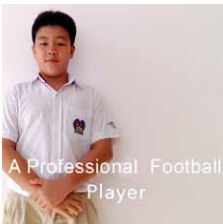
A Professional Football Player