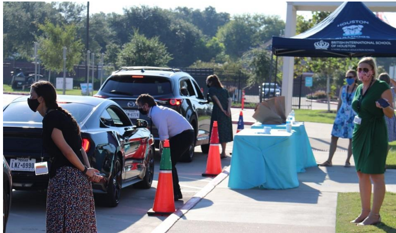
At BIS Houston's 2020 Orientation Day, families seamlessly navigated new drop off/pick up routes.

Northbridge International School Cambodia welcomed students back on Monday. Having the proper safety guidelines in place, including masks, is important for students as well as teachers and support staff.