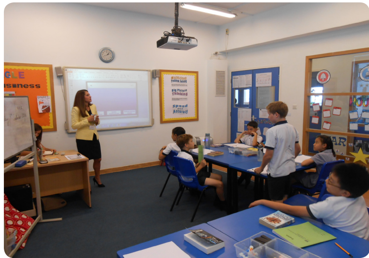
Year 6 turn the tables by interviewing the interviewer!