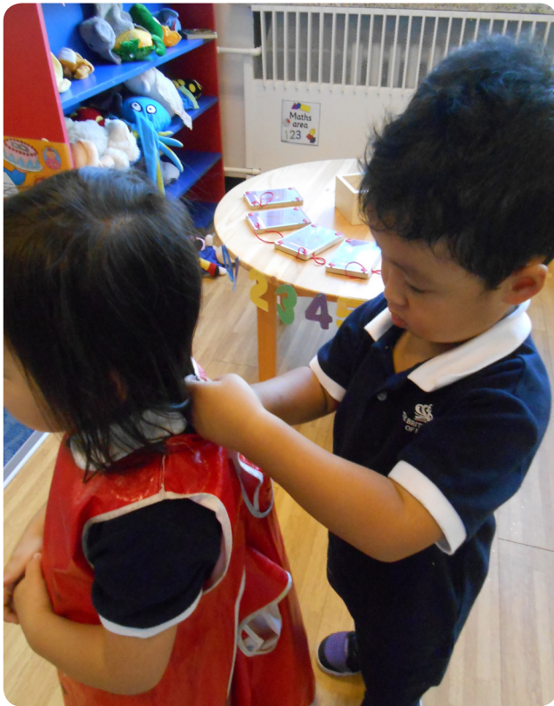
Helping to fasten the painting aprons

It's only week three and the children are already making super friendships.