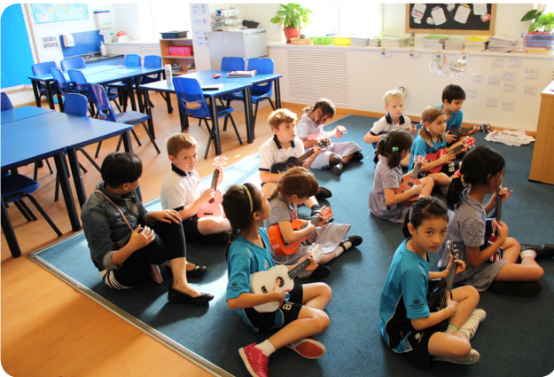
The Ukulele players are warming up! Perhaps the next Eddie Van Halen is amongst this group of BSB, Sanlitun students!

After School Activities have started this week with great gusto! A broad selection of choices covering academics, arts and sports has resulted in some great ASA provision from the teachers at BSB and our children are already enjoying the selections that they have made! From Ukulele Club to Climbing Wall, Table Tennis to Finger Painting, BSB Sanlitun has been abuzz with enthusiastic young people really enjoying the activities on offer: