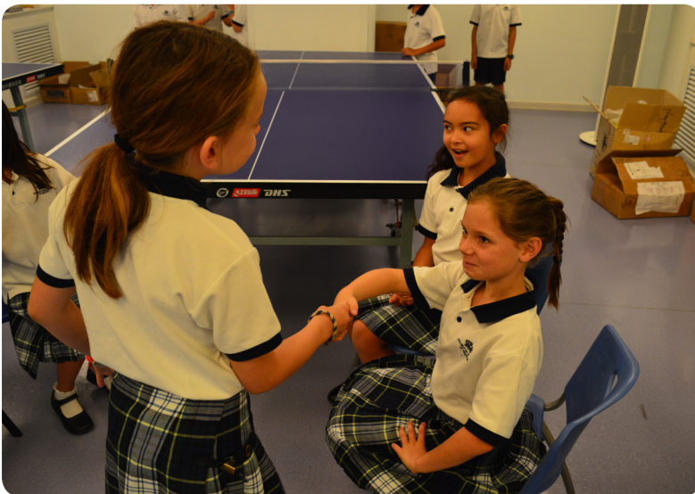
Year 4 students using drama as a method to inspire their creative writing

We will go on to watch back the video footage to trigger ideas for a descriptive piece of writing. The children thoroughly enjoyed fulfilling the diverse roles and we look forward to the wonderfully imaginative pieces of writing that this interactive experience is sure to inspire!