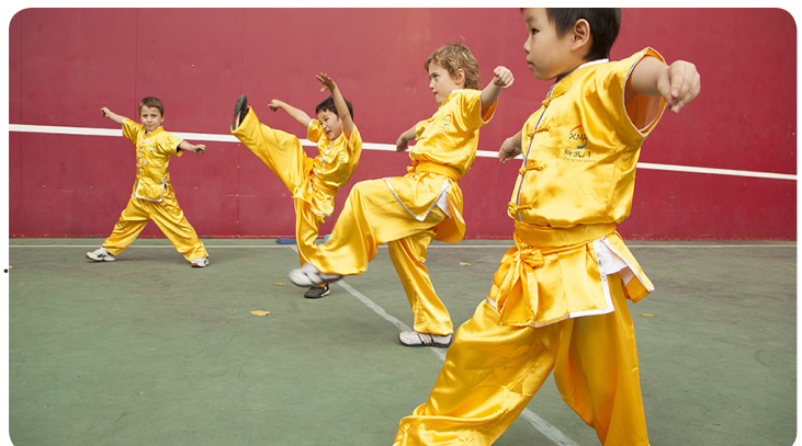
XMA Martial Arts students