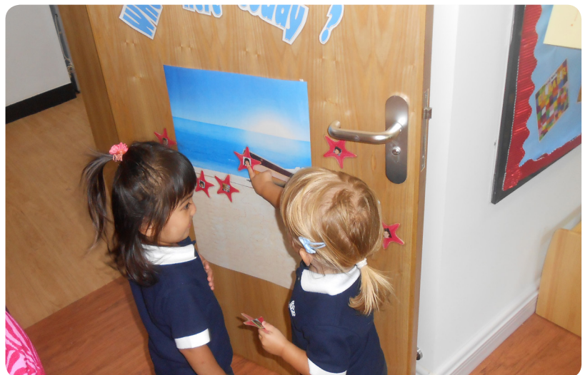
Nursery children helping each other find their names at morning registration

They are learning the key social skills right here in our Nursery which allows them to be happy in a wider social setting.