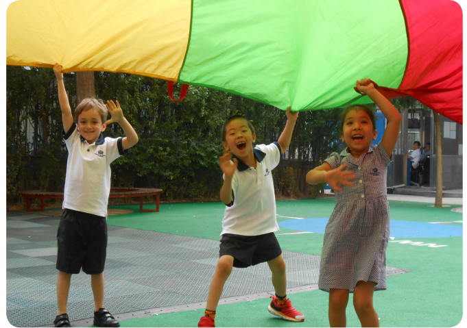
Using parachute games to learn about the days of the week

We have extended our computer skills, using the mouse to click and drag to create circles on the '2Simple' program. We made long caterpillars and numbered the body parts - or if we felt clever, we counted the legs by counting in twos!