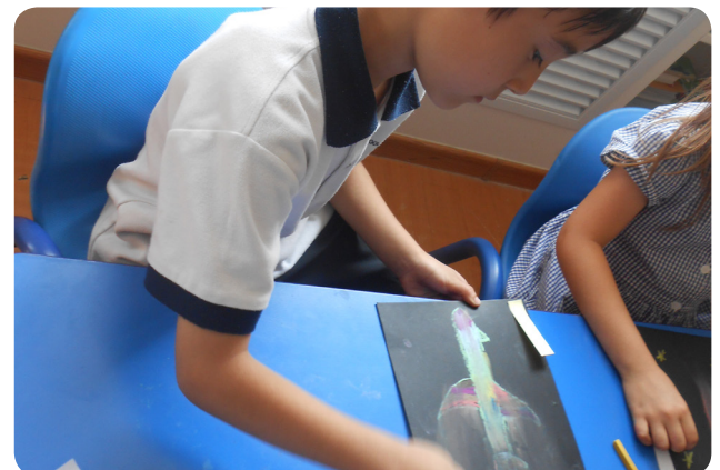
Year 2 students concentrating hard on their pieces of artwork