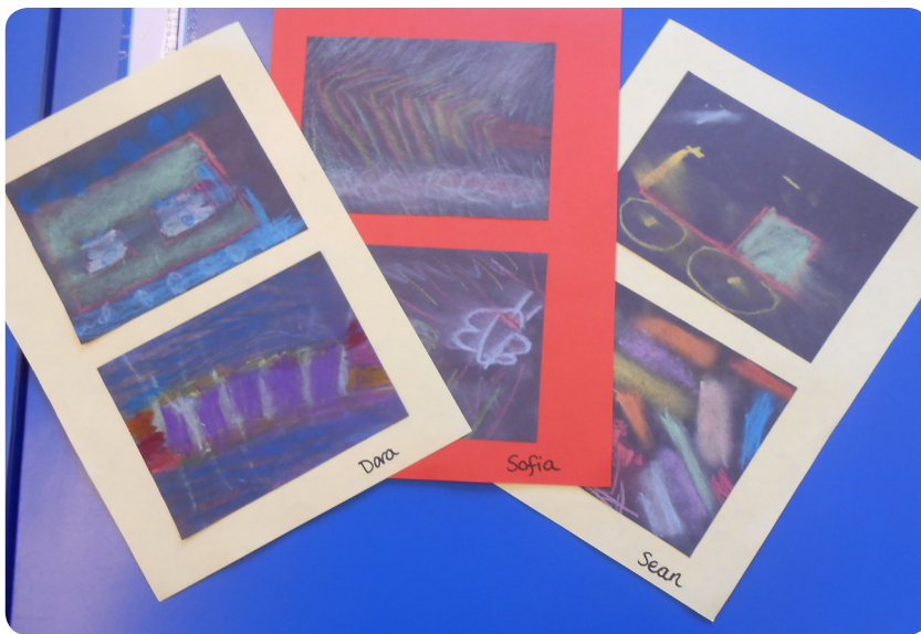
Examples of the finished artwork from Year 2 students

Pandas, Alligators, Elephants and Monkeys have gone transport mad! Since introducing our topic From A-B the Year 2 children have been discussing lots of different ways that we can travel. The children brought photographs from home which showed them using different means of transport. We have seen the most extraordinary ways of travelling. Would you believe the Year 2 children have been on speed boats, cable cars, helicopters, rickshaws and ox carts to name but a few. The adults in Year 2 really enjoyed listening to the children recount their experiences of using both familiar and unfamiliar transport methods.