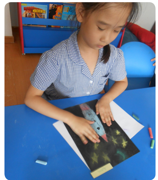
Carefully using smudging techniques

Inspired by our topic the children were keen to create some art work. First of all we looked at examples of paintings from famous artists including Giacomo Balla's 'Speed of a Motorcycle' and Luigi Russolo's 'Automobile at Speed'. The children commented on the use of line and shape to create an image which appeared to be moving. Each class then discussed how they could use similar styles to create their masterpieces. Year 2 creativity was flowing as the children used different shades of pastels and a range of smudging effects to create their own moving transport picture. Superb work Year 2!