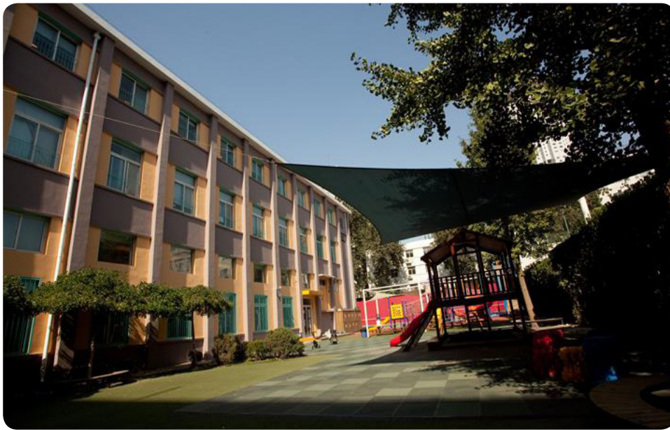
The Sanlitun Campus - a hive of activity at all times of the day

During the week days our school is a hubbub of school activity and there is so much going on it can be hard to keep up. But when the children go home every day the hubbub doesn't stop! In line with our ethos of being a community hub and being community-spirited we allow our facility to be used by a number of clubs and groups who offer both children and adults an opportunity to come together in a number of ways. If you were to pass by the campus on a weekend or on an evening you may hear music pumping out from Heyrobics, or a victory cry from a child at Club Football.