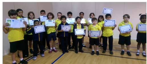
Primary Certificate Winners