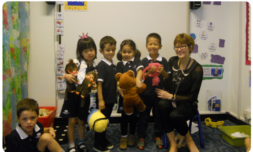
Showing our bears to the rest of the class