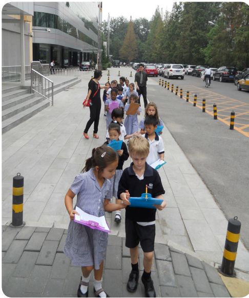
Following our carefully drawn maps

Year 2 has been working really hard learning all about different types of transport for our topic 'From A to B'. In Geography we have been working on map skills and in maths we did work on data handling. Last week the Year 2 classes all had a chance to put their new skills into good use with a walk around the local area.