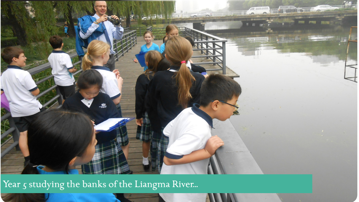
Year 5 studying the banks of the Liangma River...