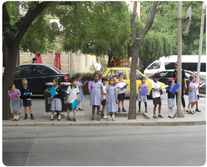
Keeping a tally of the transport coming past

The children were able to map out a simple route on a map of the area, keeping us safe by not having to cross any roads! We were able to find key landmarks that we had been looking at on the map, for example, the canal and Capital Mansion.