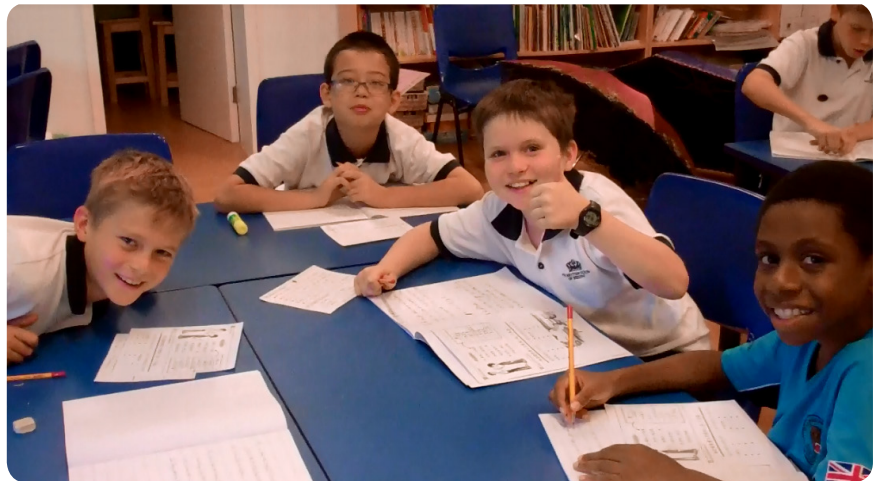
Year 6 enjoying their Chinese lesson

In Year 4 Summer Palace class children did role play. They were so excited to be a TV reporter to interview the owners of special food shop. Children worked hard to write their interview summary. They could be a reporter or a shop owner and video their interview. All children did a good job.