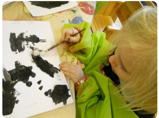
Look at all the fun activities we have been doing as part of our 'Bears' topic!