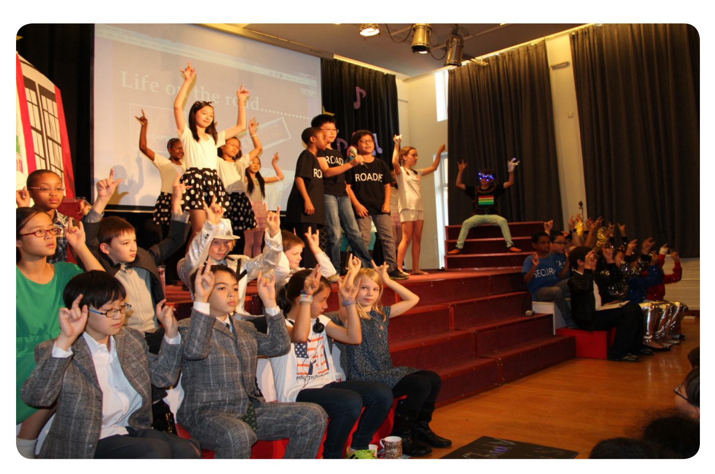
The ensemble of Year 5 and Year 6 students all participating in a 'Poptastic' performance

Music was in the air at BSB this week thanks to our fabulous Year 5 and 6 production Poptastic! We were rockin' and rollin, hoppin' and boppin, twistin' and shoutin' as we followed the story of Charlie, a dreamer, who becomes a superstar with the help of the mysterious Poptastic.