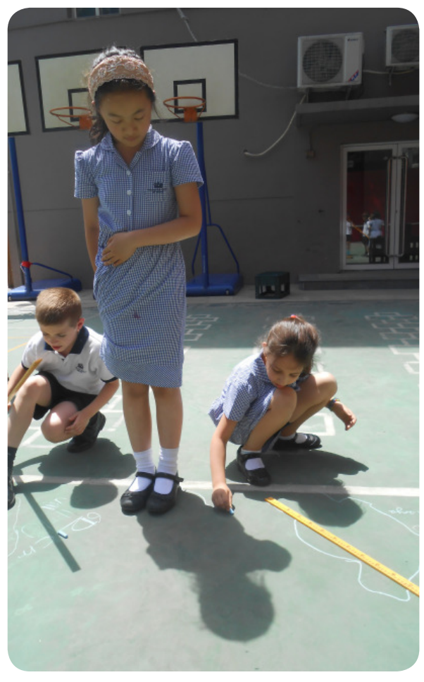
Carefully measuring the shadows at different times of the day to compare how they change