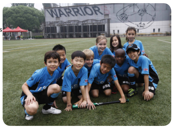
Our super T Ball team