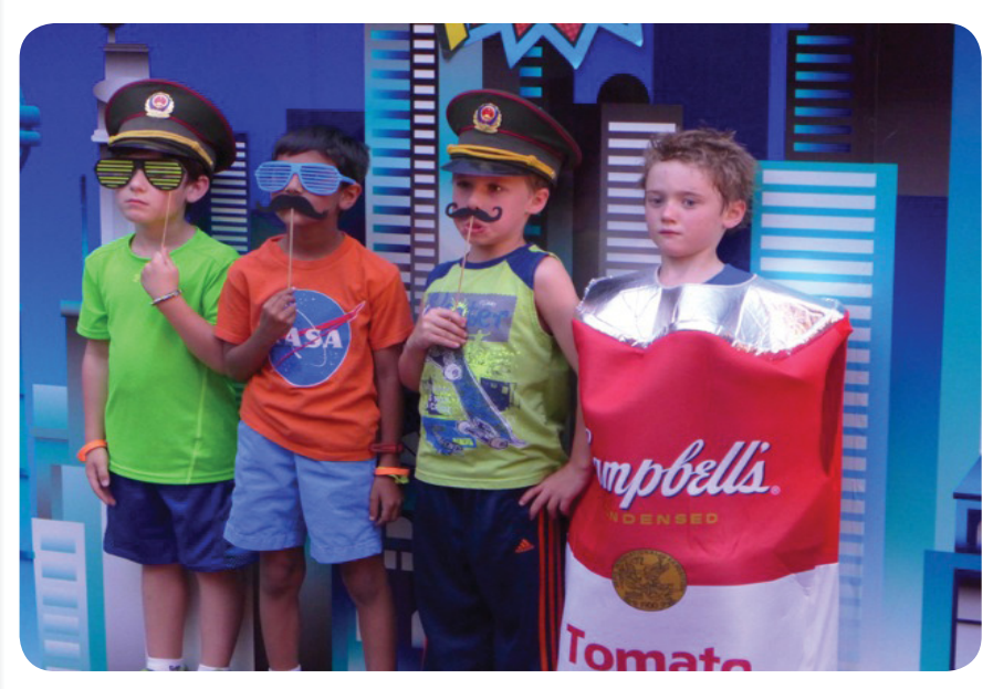
Year 2 boys posing at the photo wall

On Friday evening 23rd May, the Parents' Association held its annual charity art auction. After months of preparation by the students and teachers creating art works for auction, it culminated in an evening of fun and creativity. Pop Art was the theme for the event, which was displayed in creative art works, exciting photo walls, colourful costumes and a giant Campbells Soup Can!