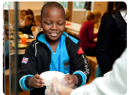
Students are encouraged to use their manners with our kitchen staff