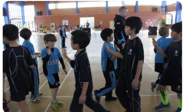
Students display good sportsmanship when representing the school