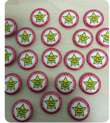
Using good manners is one of many things celebrated with Star Citizen