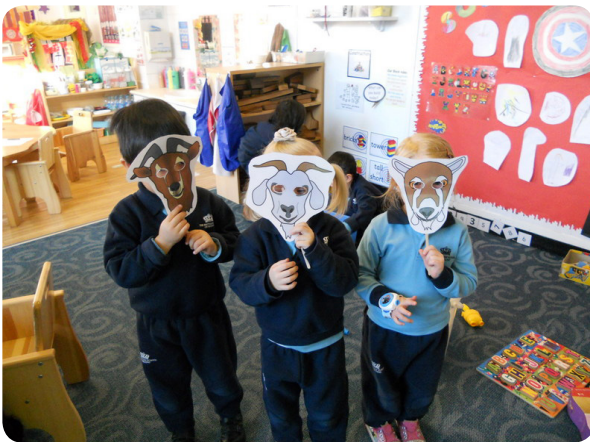
Our goat masks