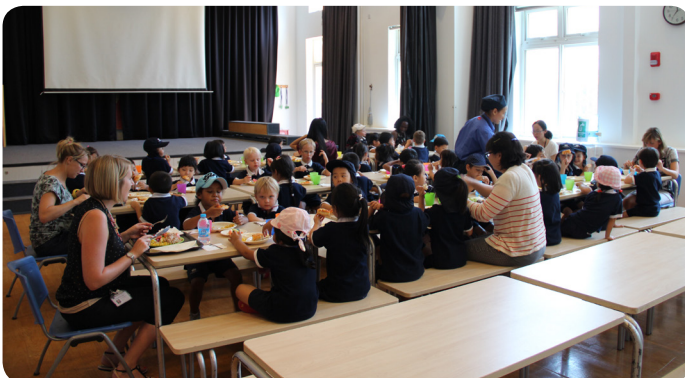
Teachers and students eating lunch together