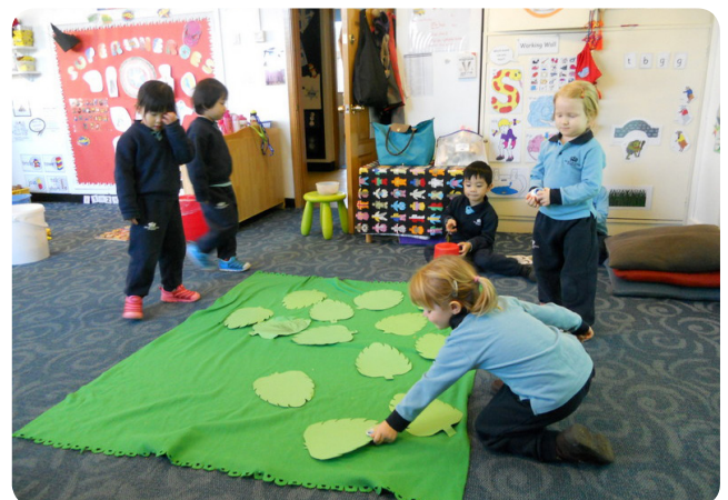
Another 'g' sound - green