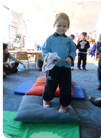
Taking photos of things that start with a 'g'