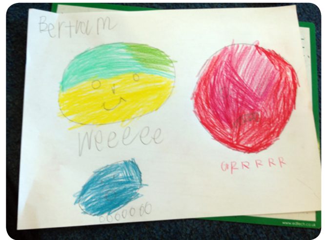
Year 1 working on expression and representing feelings with different colours