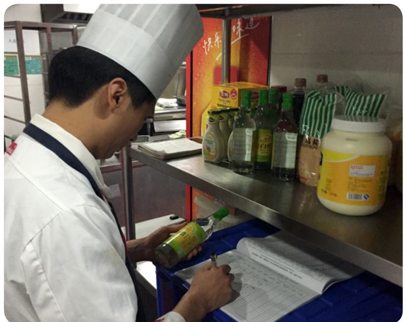
Sodexo Staff at work