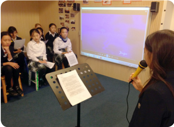
Year 6 Eagles, listening and peer-assessing their class friends performance