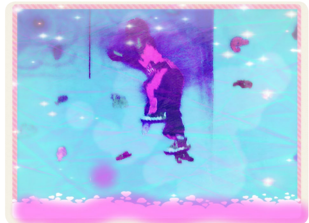
Emellie in Year 3 used different filters to add texture and depth to her photo