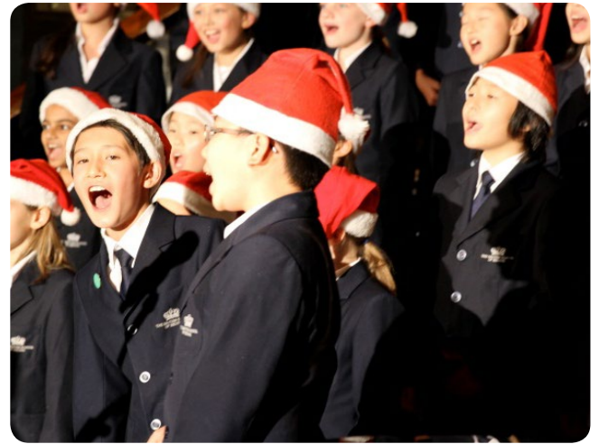
Collaboration and confidence when performing on stage

Through our everyday lessons we practice and exactly know what to expect when step on the stage and perform to the public. BSB SLT students have a range of opportunities to represent their skills, through our school assemblies, class assemblies, productions or choir performances.