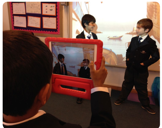
Year 4 creating their documentaries