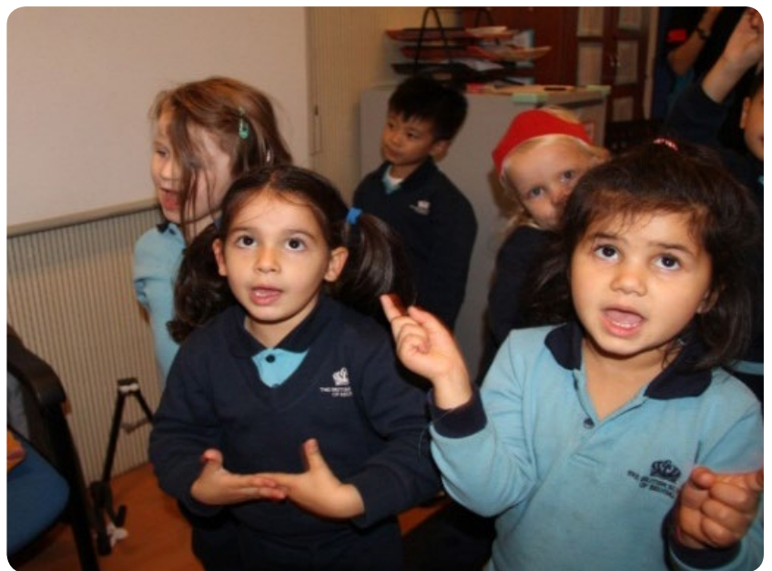
Reception children persevering and concentrating hard to expressively deliver the song