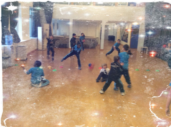
Alix in Year 4 using different filters and editing effect on her ball games photo

The children have learnt and applied new skills very quickly and should be very proud of their work.