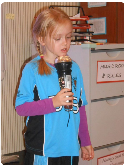
Taking a risk and performing a brand new song

In our lessons we are very much focused on developing the singer individually. We are always putting the singer first and then the song, because there will be no good songs without a good singers. We even tie our songs to topics being learnt in school: earthquakes, global warming, chocolate, space and more. Through connecting our choral programme with their topic work we give our students a great motivation and a reason to love singing even more.