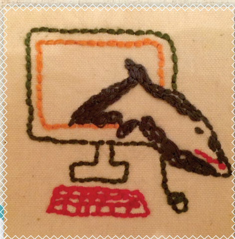
Collège Champittet Pully