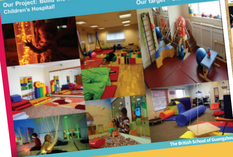
The British School of Guangzhou

Our Project: Build the first Therapeutic Play Space in Kramare University Children's Hospital Our target – 20,000 Euros