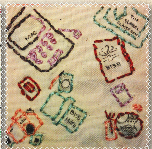
British International School Boston

Firstly appreciate the sewing! And secondly can you see the features that they think make their school individual?