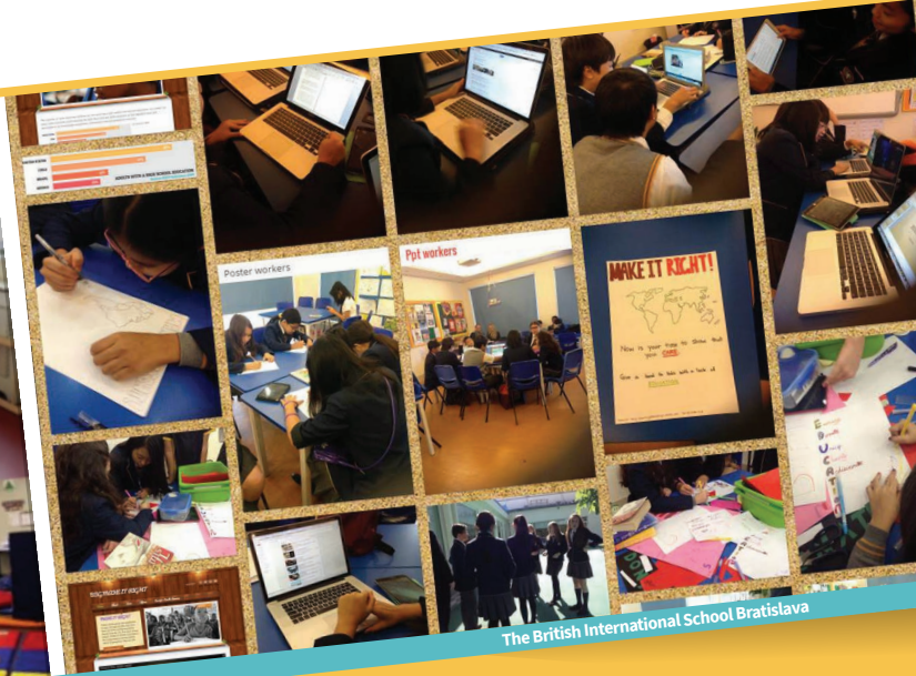
The British International School Bratislava