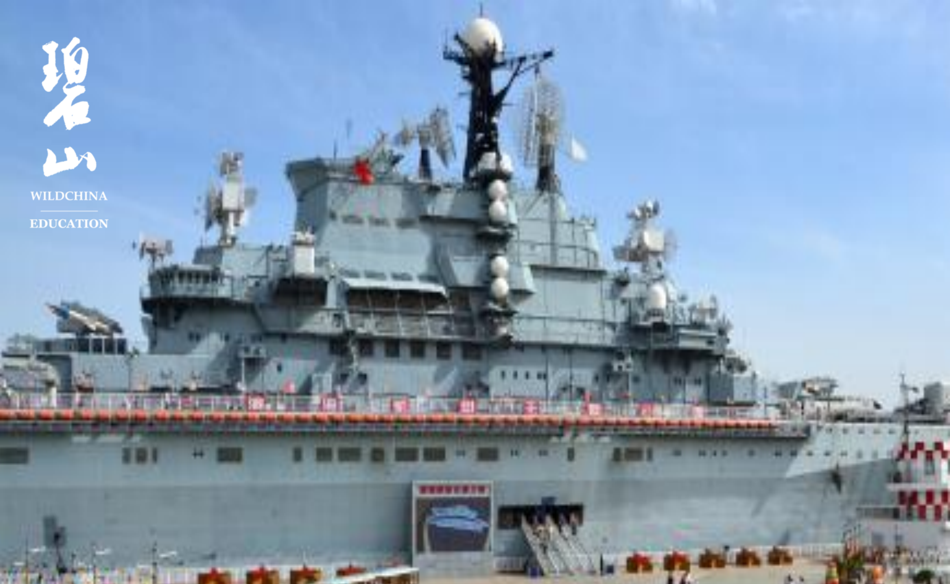
Day 2: Tianjin Museum scavenger hunt + Binhai Aircraft Carrier