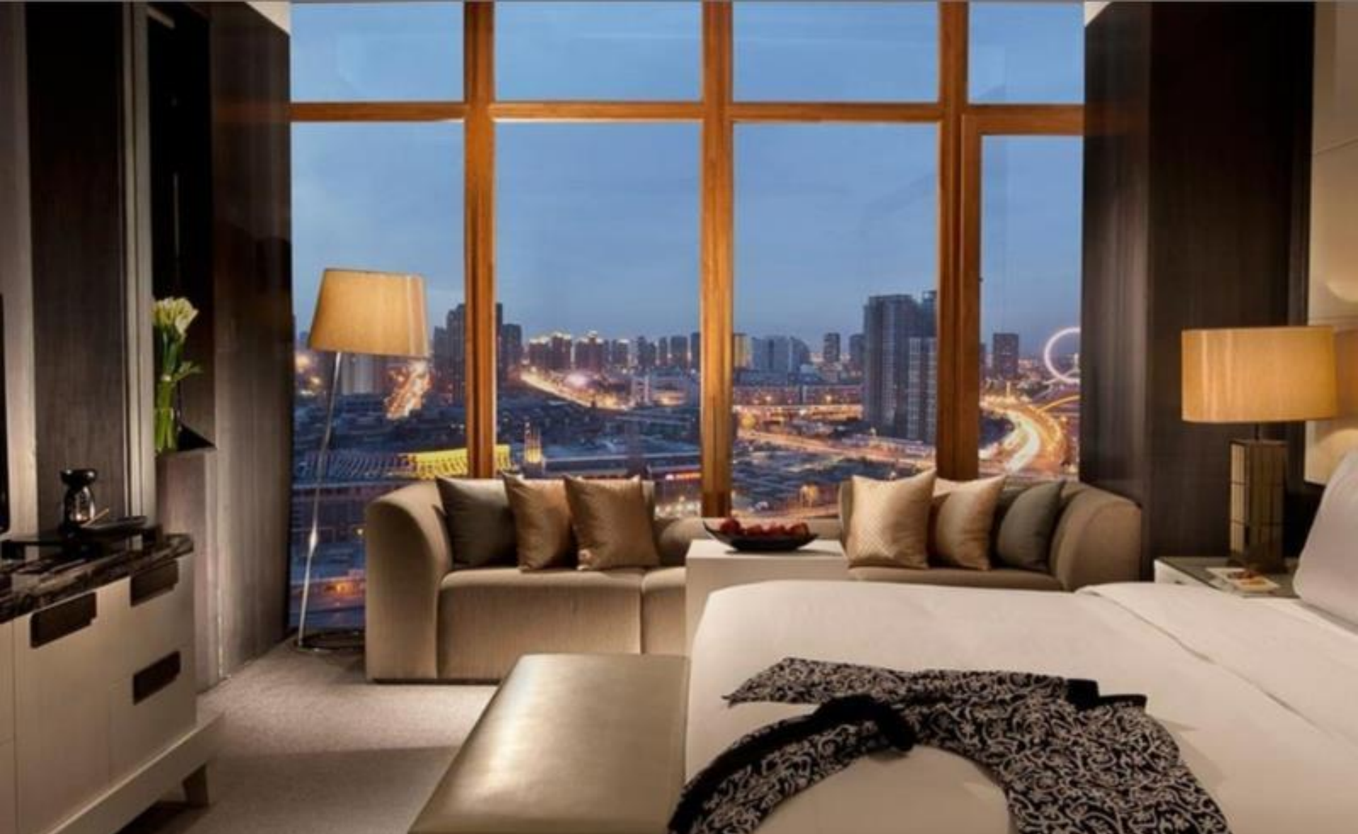
Tianjin Riverside Hotel