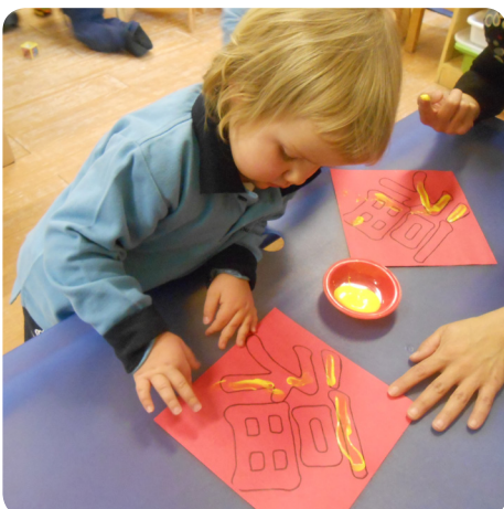
Good luck painting