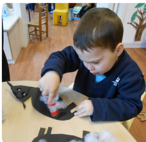
Sticking a woolly sheep