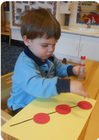
Tang Hu Lu

Art activities also provide good opportunities for the children to develop their fine-motor skills, picking and sticking materials, hand and finger strength beginning to make snips using scissors. The whole process of an art project enables the children to feel a great sense of self-esteem. It allows creativity into their world.