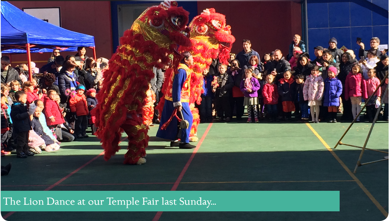
The Lion Dance at our Temple Fair last Sunday...