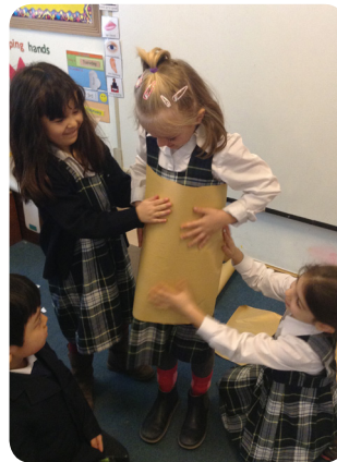
working collaboratively to check the armour fits