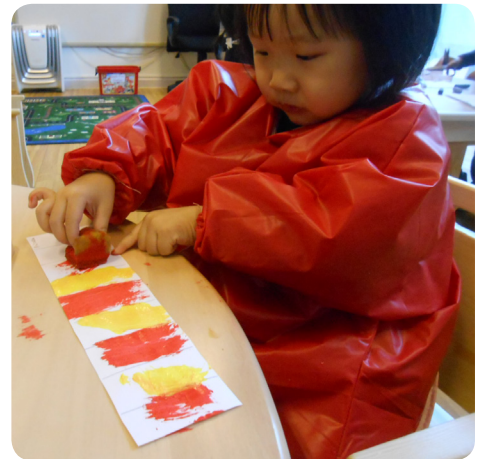
Making a pattern