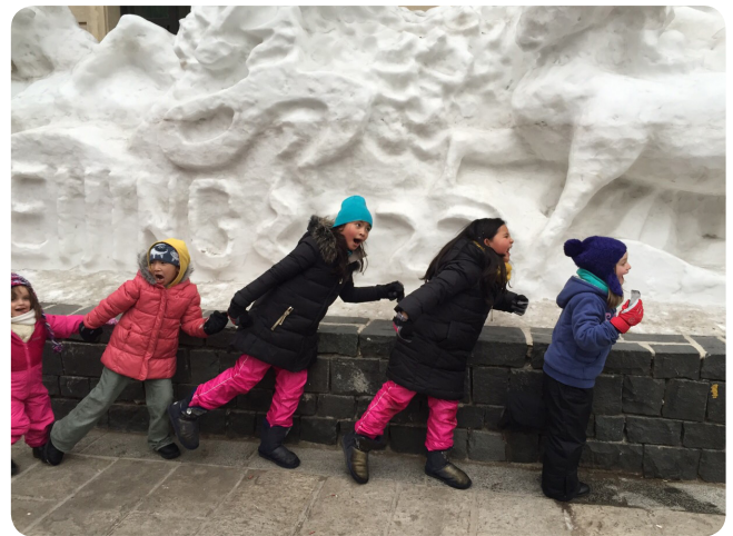
Posing in front of the ice sculptures