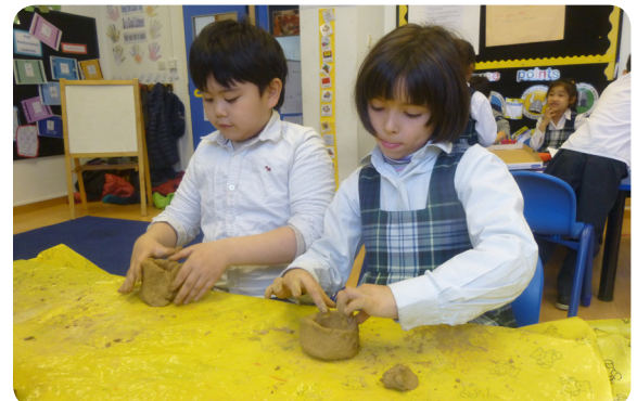
Year 2 concentrating on their work