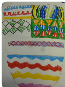
Aztec cup designs

As part of the topic the children have also been learning about the origins of the cacao bean. This week the children looked at its Aztec roots and have been observing and critiquing Aztec artwork. The children designed their own Aztec inspired hot chocolate cups using simple patterns and have now made their cups using clay. Next week the classes will again visit the art room where the children will paint their clay cups before evaluating their work.