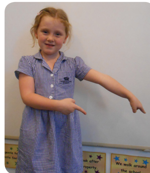
Retelling the story for the Emperor's New Clothes with talk for writing actions