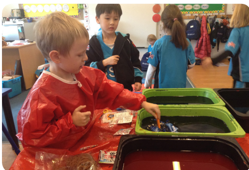
Designers of the future