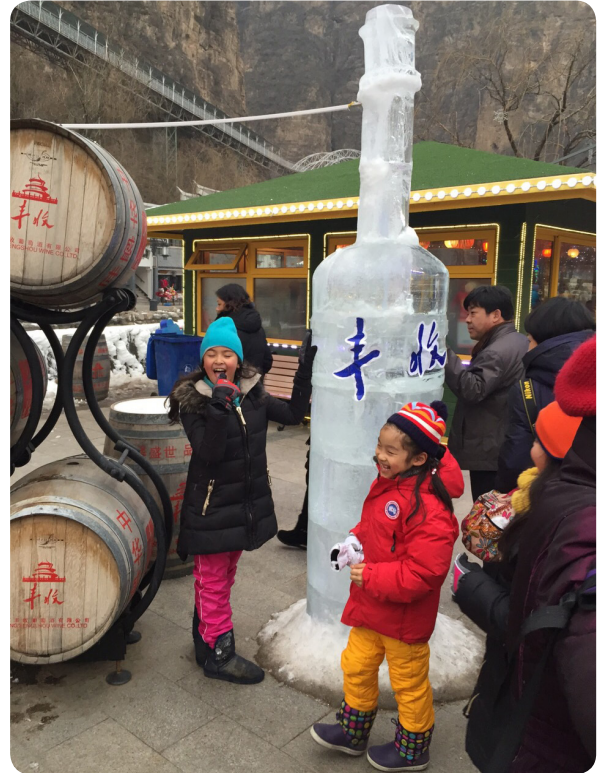
Magnificent ice sculptures