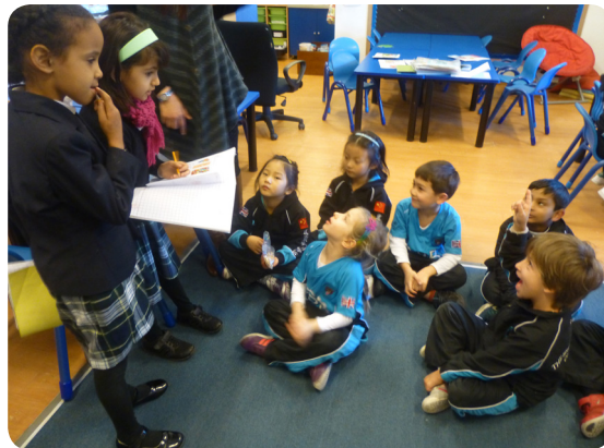
Year 2 collecting information from Year 1

The Year 2 children have been busy merging maths with our topic this week as they have been completing surveys to find out which is the most popular chocolate topping in school. Each class visited a different year group and had to show collaboration along with confidence when speaking in front of another class. The children have now analysed the results and presented their findings in a variety of ways. We will be revealing the most popular topping in the last week of this half-term when we will be selling a variety of delicious child-made chocolates. Start saving your RMB - our chocolate will be better than a bar of Wonka's Whipple-Scrumptious Fudgemallow Delight!