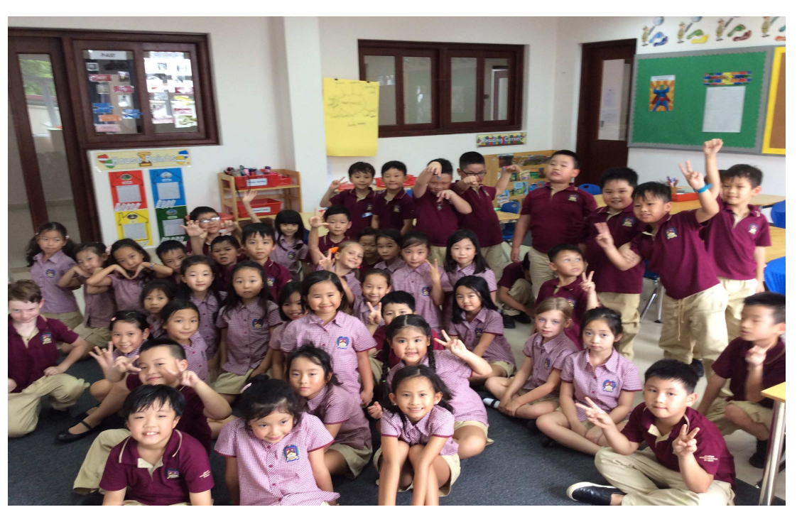
Term One August - December 2016