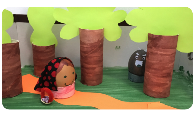
By Bella Monterola, Year 4 Herons