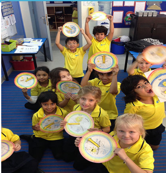
In Year 1 and Year 2 French, we made puppets and weather wheels to celebrate what we have been learning.