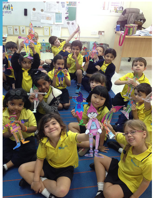
Year 1 "Body" and Year 2 "Calendar, seasons and weather".